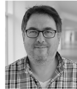
Investigation leader Professor