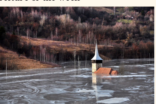
Flooded church in Geamana, Romania, picture by Carline Rehlen, D-MAVT student