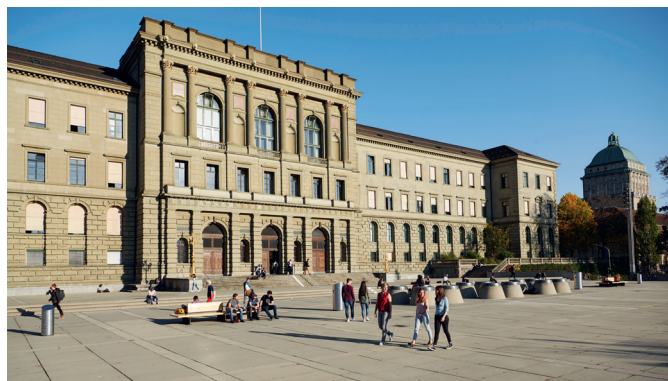
The main building, designed by Gottfried Semper, opened in 1864.