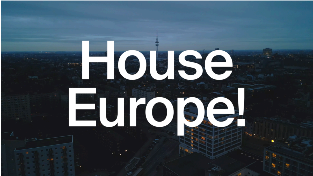
Still from The Demolition Drama (s+ D-ARCH ETH Zurich, 2023)