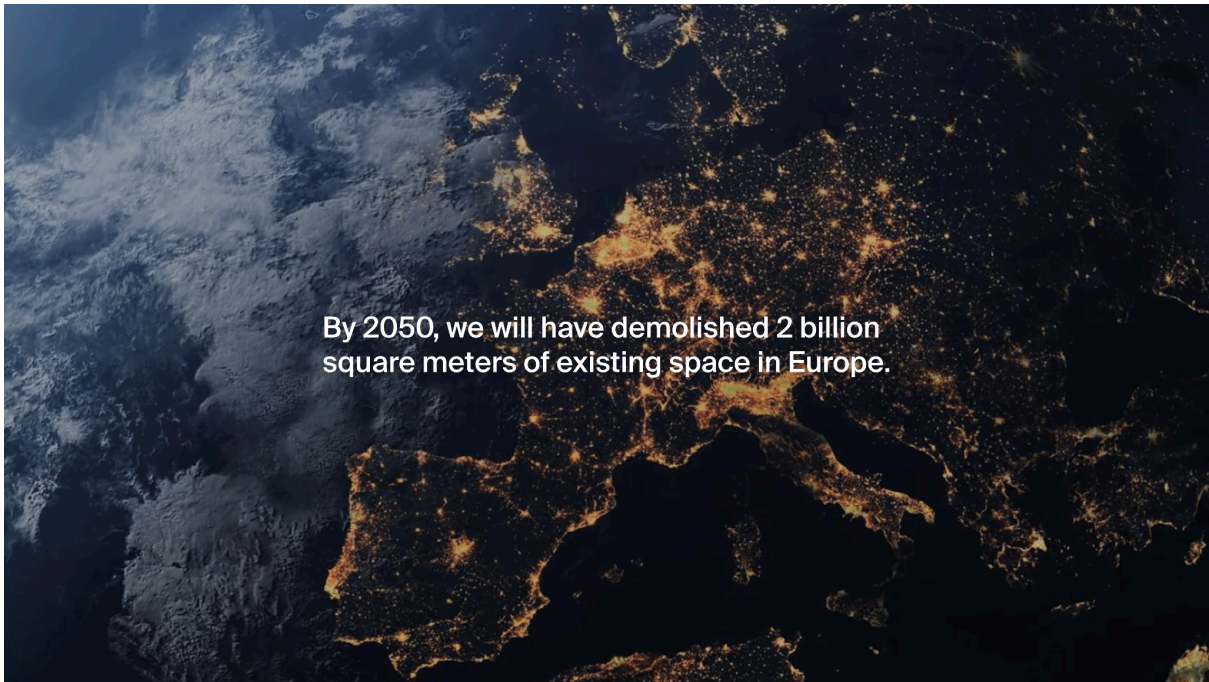
Still from The Demolition Drama (s+ D-ARCH ETH Zurich, 2023)

By 2050, Switzerland is anticipated to grow by 1 million people.