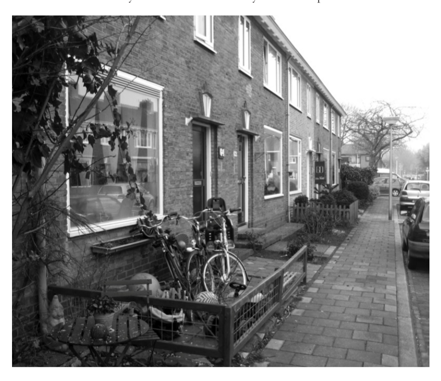
Foil 16 This is a Dutch social home with a bicycle in front, of course. I'll tell you a little something about how the system works in 3 other countries.