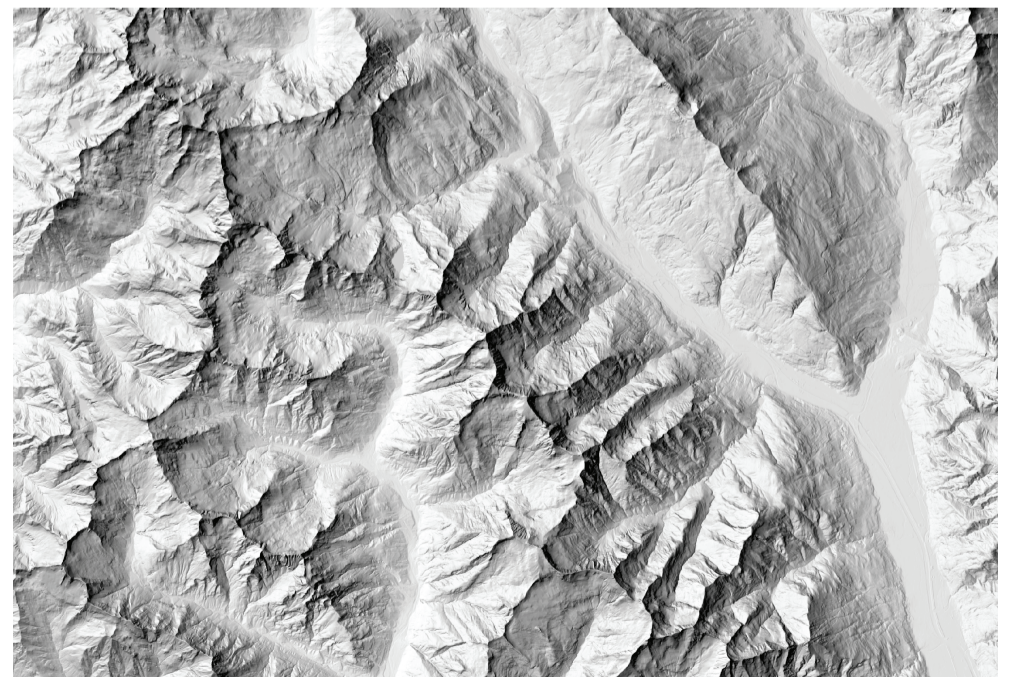
Figure 3: Shaded relief with the aerial perspective effect (Brassel, 1974), calculated within watersheds, and complemented with changes of the light direction

This work is a part of a larger framework developed at the Institute of Cartography and Geoinformation to enhance the overall appearance of analytical shaded relief. It is possible to complement the aerial perspective effect with the light changes also performed within watersheds based on streams orientation. An extra light source originating from the Southwest is used to accentuate the ridges oriented parallel to the standard light direction, which is generally recognized to originate from the Northwest.