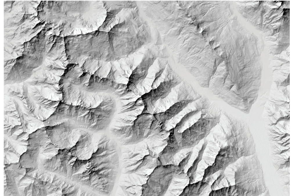
Figure 2: Shaded relief generated using the Hillshade function combined with the aerial perspective effect (Brassel, 1974) calculated within watersheds

The results demonstrate that both global and local approaches properly simulate the aerial perspective effect.