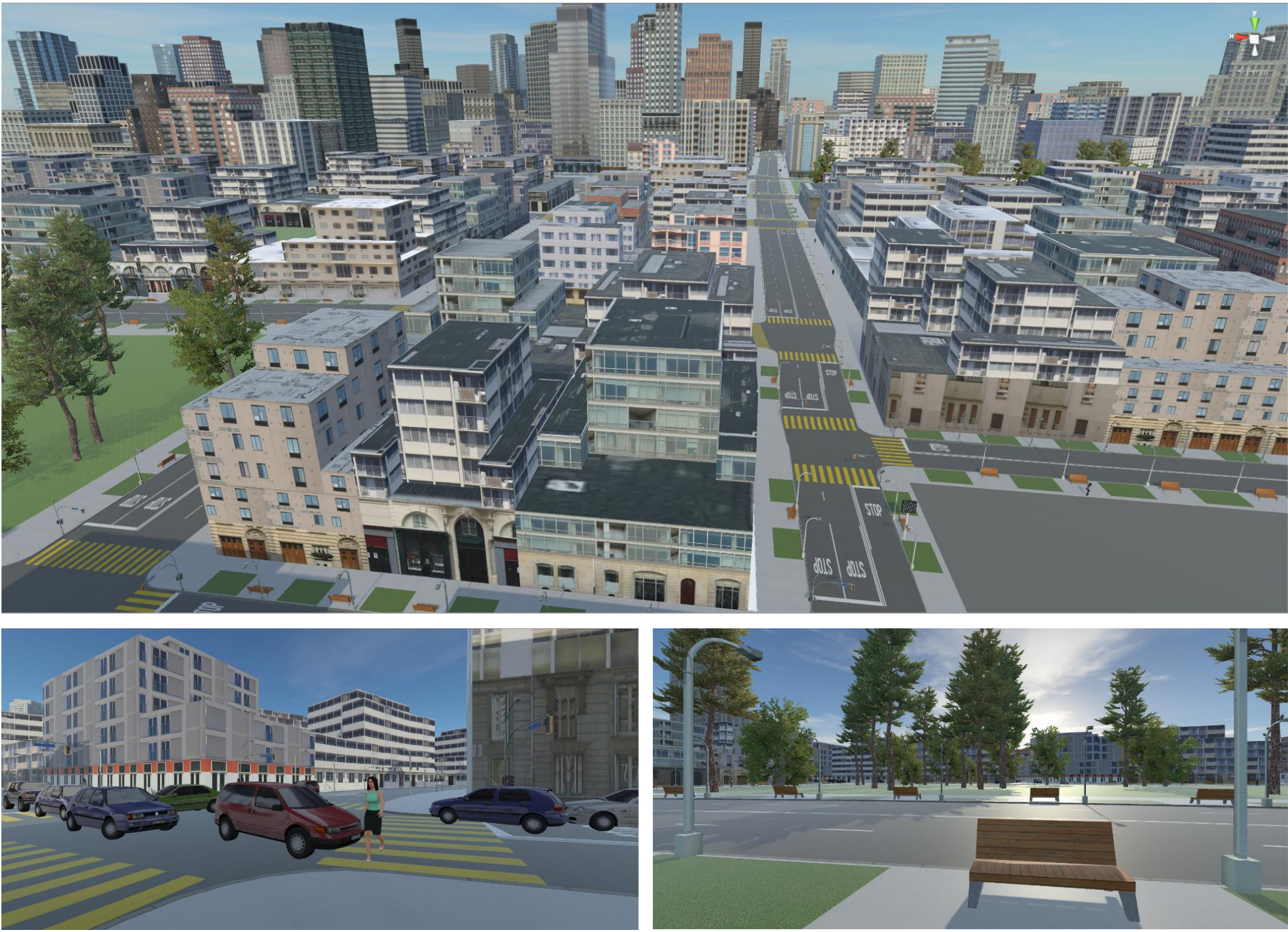
Figure 1: Impressions from the virtual environment

A user study has been performed to compare the different approaches in a virtual environment (in comparison to a real environment) that was designed with the aid of CityEngine and Unity3D. The environment features an enhanced degree of realism including street furniture, a randomly assigned traffic system with cars and pedestrians as well as skybox rendering, lighting and shadows.