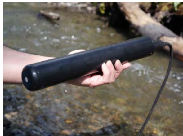
Fig. 2: Acoustic sensor for measurements of suspended sediment concentration (LISST-ABS) ( www.sequoiasci.com )