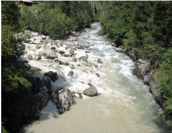
Fig. 1: Wysswasser (left), downstream of HPP Fieschertal, at the confluence with the Rhone river, August 2010

This case study offers the opportunity to get some insight into fine sediment management at HPPs, corresponding real-time measuring techniques and data treatment. These topics are expected to become more important in the future, both in Switzerland and worldwide.