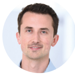
Konrad Tiefenbacher Synthesis of Functional Modules