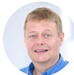
Sven Panke Bioprocess Laboratory