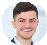
Randall Platt Laboratory for Biological Engineering