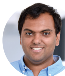
Sai Reddy Laboratory for Systems and Synthetic Immunology