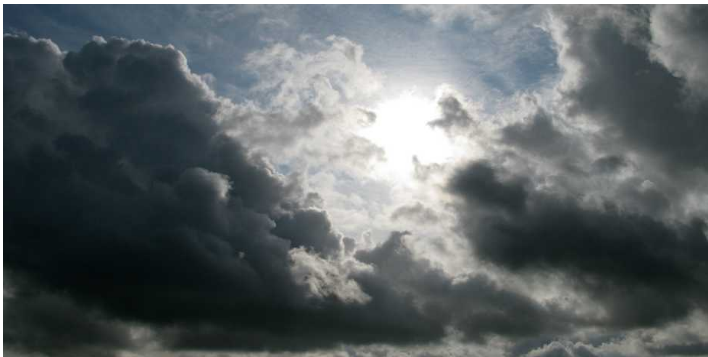
Clouds are water droplets dispersed in the air and thus an aerosol.

ETH Zurich researchers conducted an experiment to investigate the initial steps in the formation of aerosols. Their findings are now aiding efforts to better understand and model that process – for example, the formation of clouds in the atmosphere.