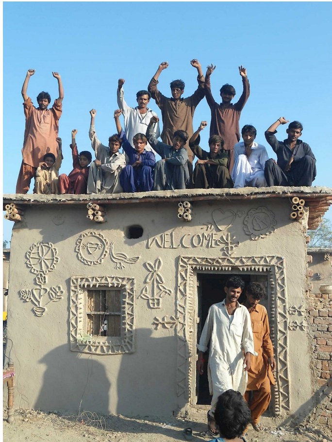
Figure 4. Maintenance of local traditions in Pakistan (Lari and Heritage Foundation of Pakistan 2011).

In Pakistan, the use of local building traditions and indigenous materials simplified the participation of the community and made new housing blend with older ones, presented in Figure 4 (Heritage Foundation of Pakistan 2011b). Bamboo structures accelerated the construction and the walls of mats resulted in a comfortable indoor climate (Lari 2011; Heritage Foundation of Pakistan 2011b). This prevented environmental degradation and supported the regional economy. With improved construction techniques, confidence was restored in local methods which corresponded to lifestyle, income and personal needs (Heritage Foundation of Pakistan 2011b). Although the designs of the houses were adjusted to personal needs of dwellers, maximizing participation and reinforcing the sense of ownership, only 8 designs were developed with only small variations in roof types and base plinths (Heritage Foundation of Pakistan 2011b).