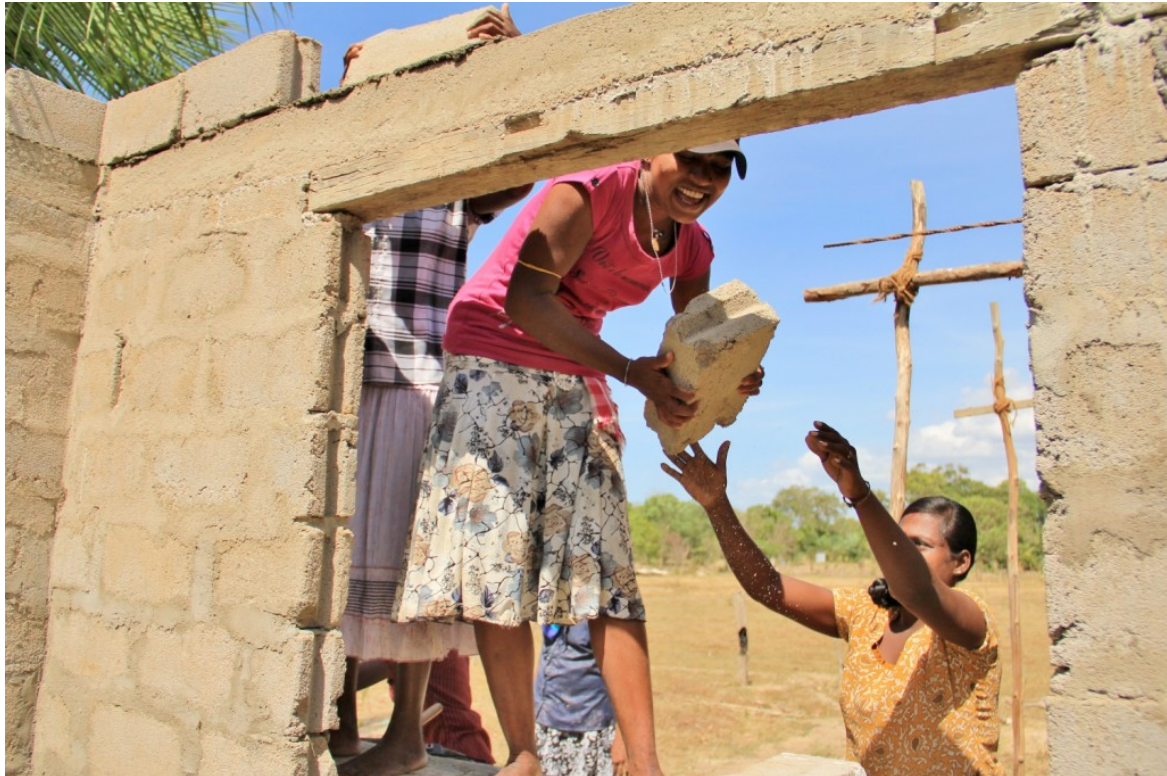
Figure 2. Practical female mason training in Sri Lanka (Jayasinghe 2013)

In Sri Lanka, due to the uniqueness of the phenomenon and overwhelming media attention, the funding received was exceptional, even more than the loss to be covered. Therefore, disaster survivors with completely destroyed houses were granted relatively large funds, Rs. 550.000, at that time equal to 4300 USD, for each house (UN-Habitat 2012). However, the initial lack of coordination between stakeholders and the misevaluation of risks led to an extended recovery period (Ingram et al. 2006). However, as can be seen in Figure 2, time and money were saved because locals were trained to build their own houses.