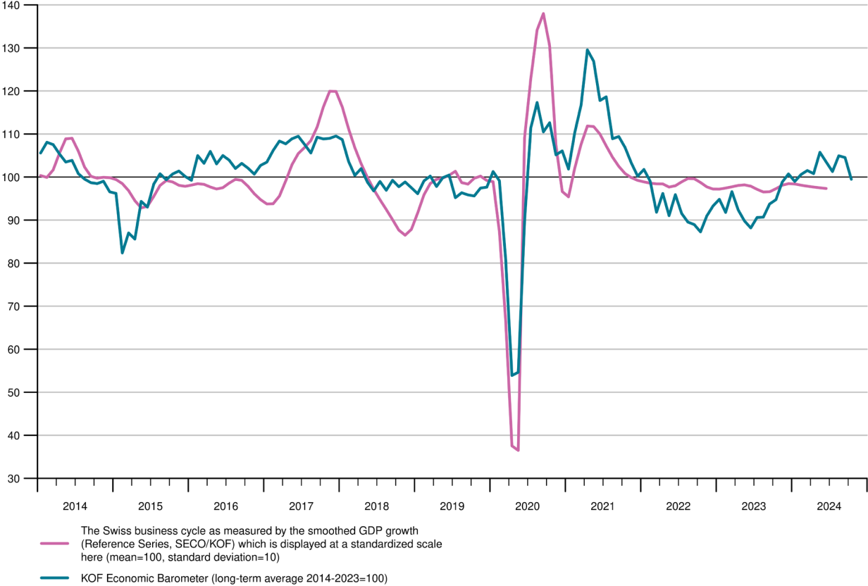
KOF Economic Barometer and Reference Series