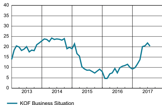
KOF Business Situation Indicator (balance, seasonally adjusted)