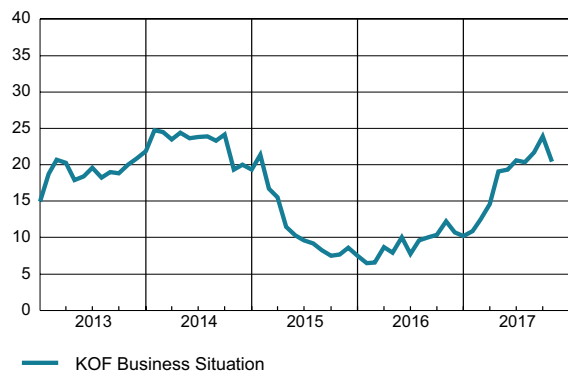
KOF Business Situation Indicator (balance, seasonally adjusted)