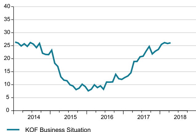
KOF Business Situation Indicator (balance, seasonally adjusted)