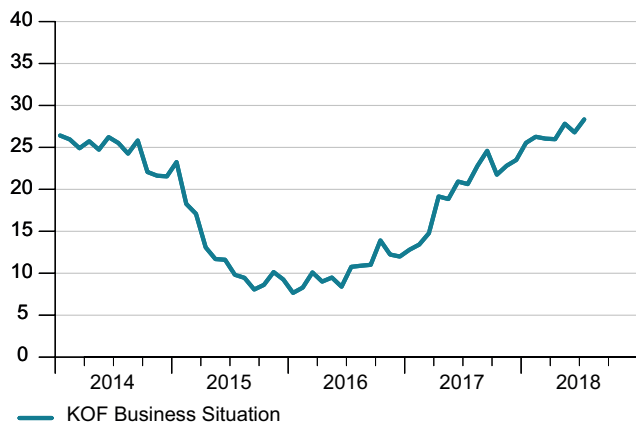
KOF Business Situation Indicator (balance, seasonally adjusted)