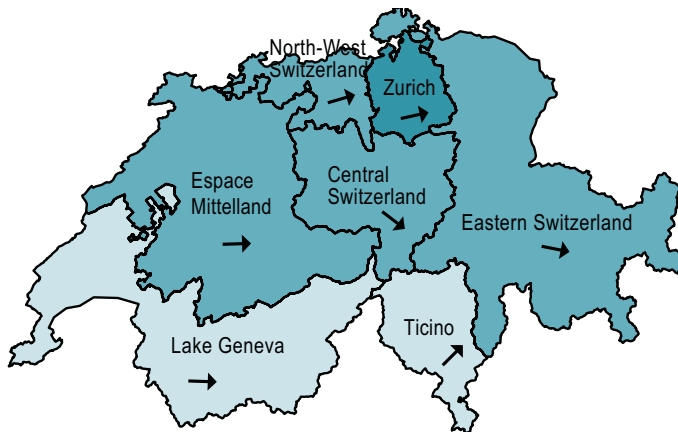
The angle of the arrows reflects the change in the business situation compared to the previous month