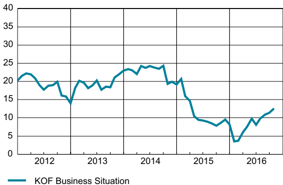
KOF Business Situation Indicator (balance, seasonally adjusted)