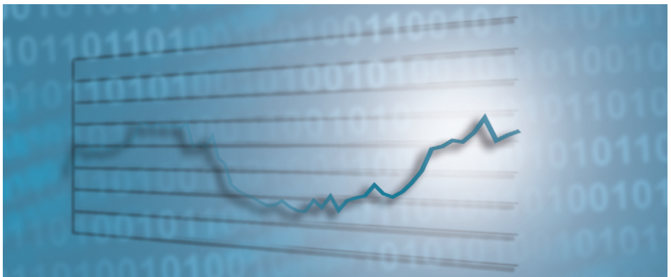
KOF Business Situation Indicator

https://www.kof.ethz.ch/en/forecasts-and-indicators/indicators.html →