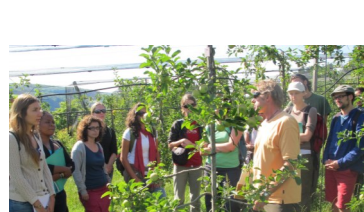
Summer School, Rheinau 2013

10-24 August 2014 WFS Summer School in Rheinau, Switzerland. The WFSC will welcome a class of 25 students from 18 countries to the Center's third summer school course held at Switzerland's largest organic farm. The participants will bring a wide range of disciplinary backgrounds and experiences to this two-week intensive, hands-on course. More information about the summer school is available here .