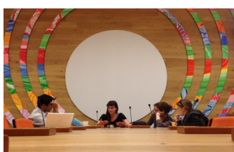
Students at FAO