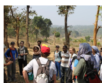
India Summer School participants

WFS Summer School The WFSC hosted its second summer school in India in February this year. The program involved 20 students from 11 different countries and disciplines and explored the food system challenges facing India, with a special focus on organic and agroecological production systems. The students worked on a case study to critically analyze the impacts of the recently passed Indian Food Security Act. The summer school is a part of the WFSC Mercator Program. Read more here .