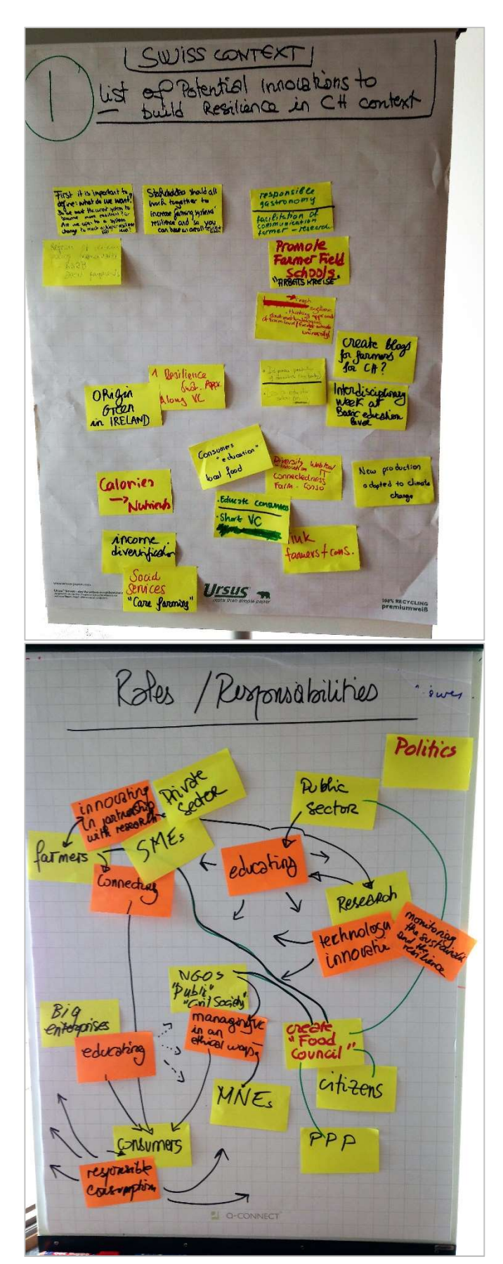
Group 1: Resilience in the Swiss food system