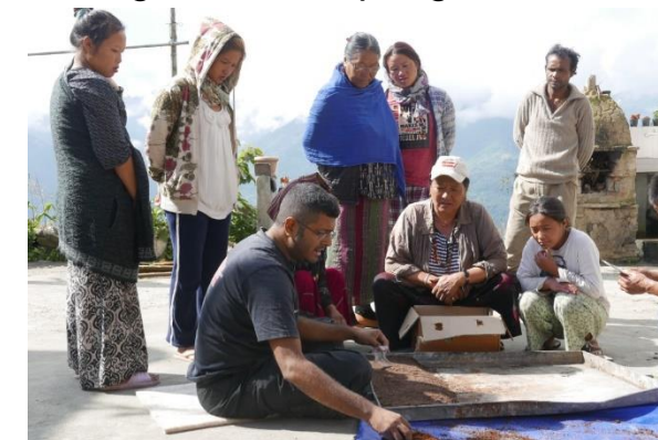
Fig 3: Example of one alumnus in Assam (India) organizing a workshop about seed sovereignty

Acknowledgements: We would like to thank Mercator for the financial support of the project and the World Food System Center Executive Office for their support and advice. From the board-members we send our thanks to all the alumni to keep the motivation on learning from each other.