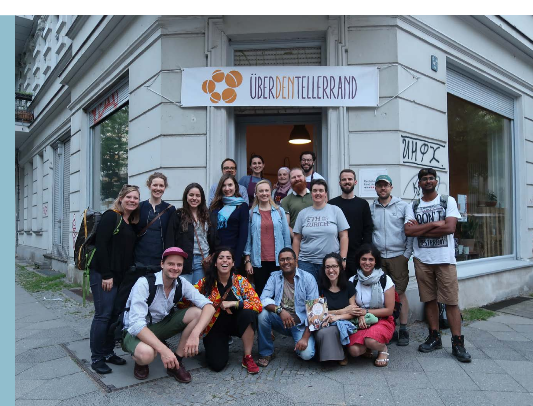
EDUCATION Alumni Activities

Poster A journey into food systems in Ivory Coast: WFSC Summer School 2018