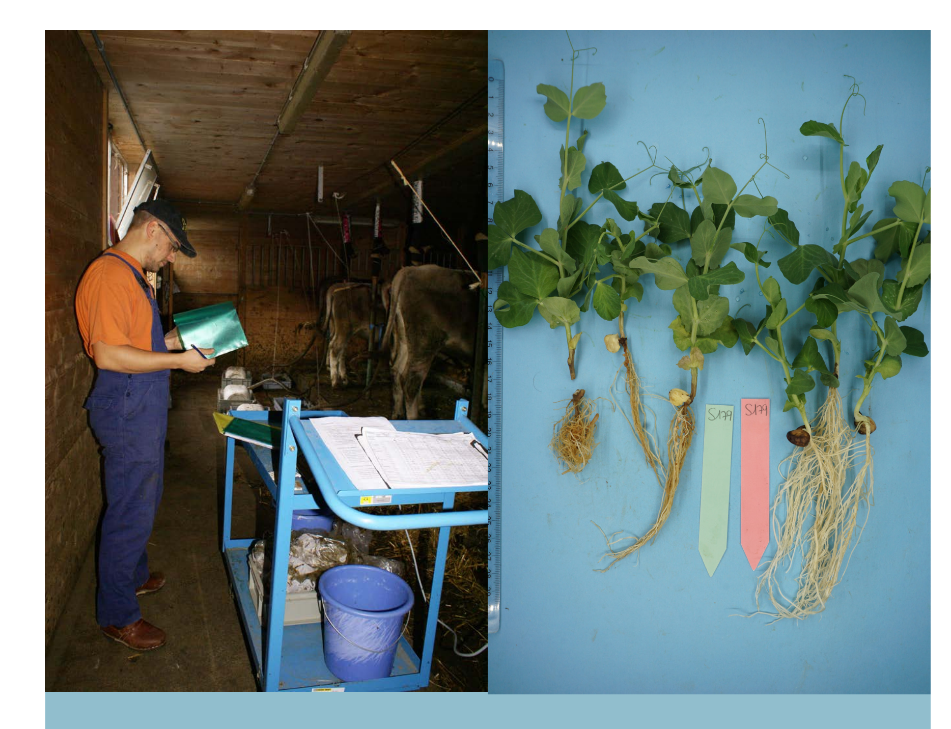
RESEARCH Mercator Research Program Organic Production Systems for Food Security

To support activities in Research, Education, and Outreach & Dialogue, the WFSC established the Mercator Program in partnership with the Mercator Foundation Switzerland. The program aims to explore the role and potential of organic production systems (certified or non-certified) to contribute to global food security.