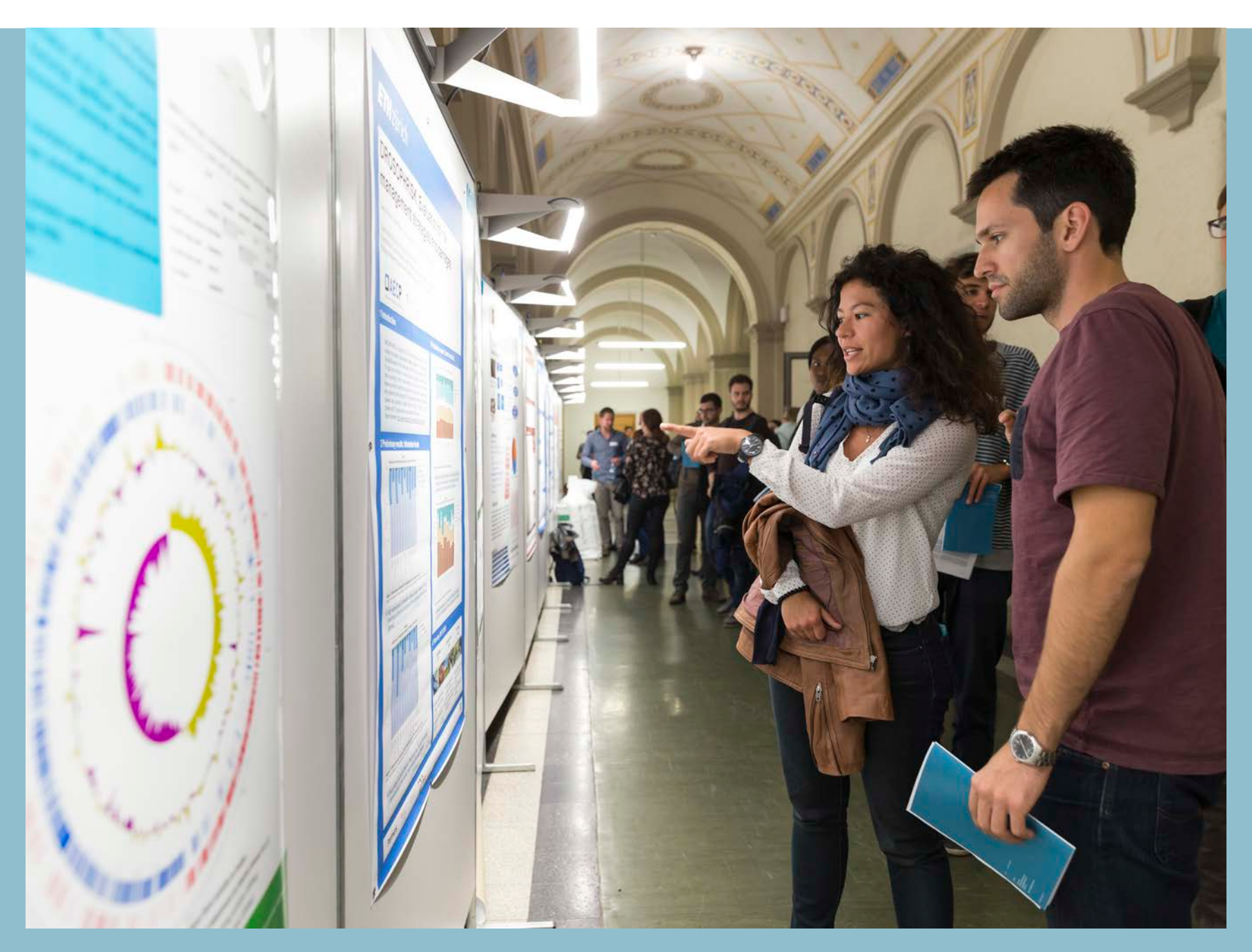
OUTREACH & DIALOGUE WFSC Annual Symposium

→ http://www.worldfoodsystem.ethz.ch/ outreach-and-events/public-and-scientific-events.html