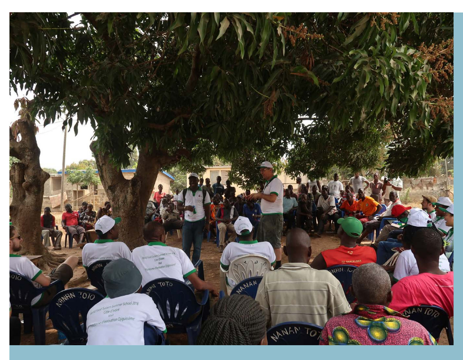
EDUCATION World Food System Summer School Courses

\rightarrow Posters # 3-8, 11, 12 and 15