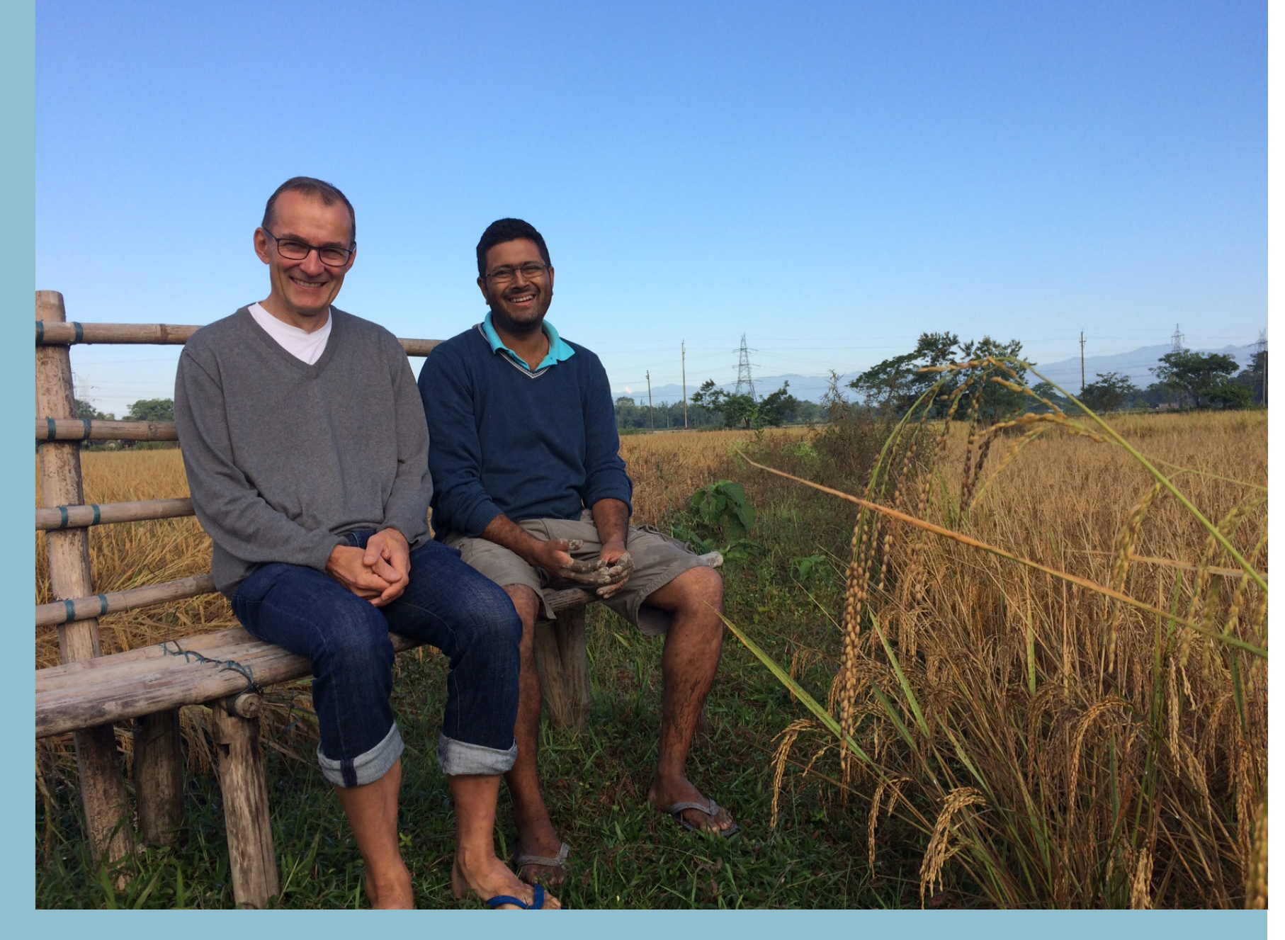
OUTREACH & DIALOGUE Ambassador Program

→ http://www.worldfoodsystem.ethz.ch/ outreach-and-events/past-events/symposium-2018.html