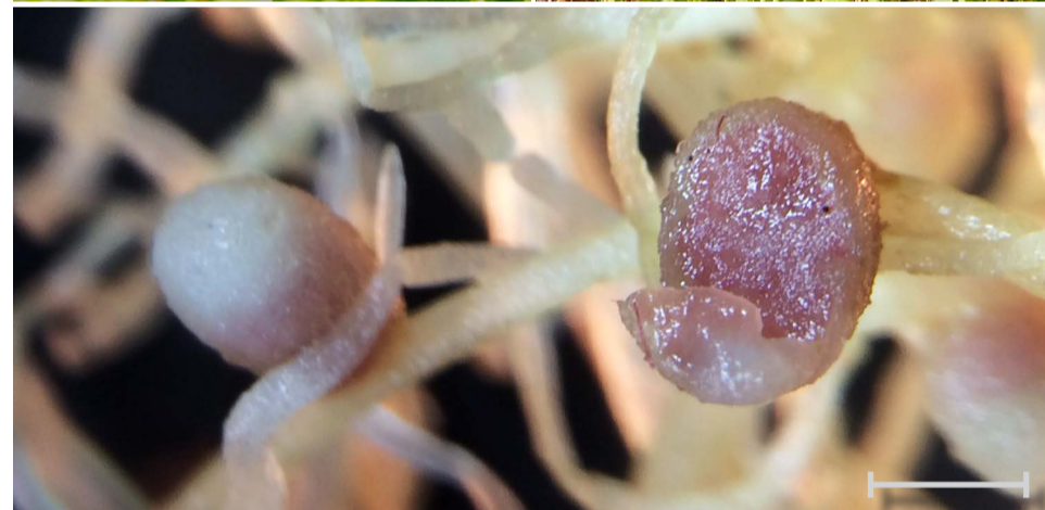
Fig. 1 Top left: Flowering pea plant. Top right: Mature pea pods. Bottom: Nodules on pea roots. The right nodule was cut transversally. Note the typical red colour of the nodules. Bar represents 1 mm.