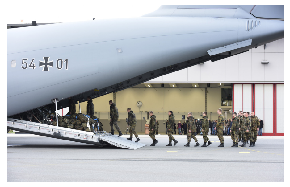
Bundeswehr personnel board an Airbus A400M at Jagel airbase in northern Germany to support the military campaign against the Islamic State from Turkey's Incirlik air base.

But would this extend as far as Germany playing a much greater military role in defending the liberal global order? The main message in the new white paper is that Germany should take on more responsibility for international security, and that Germany should therefore boost its military role on the world stage. This core message reflects am emerging trend: in recent years, Germany has become more active militarily, has promised to spend more on defense, and is cooperating more closely with allies.