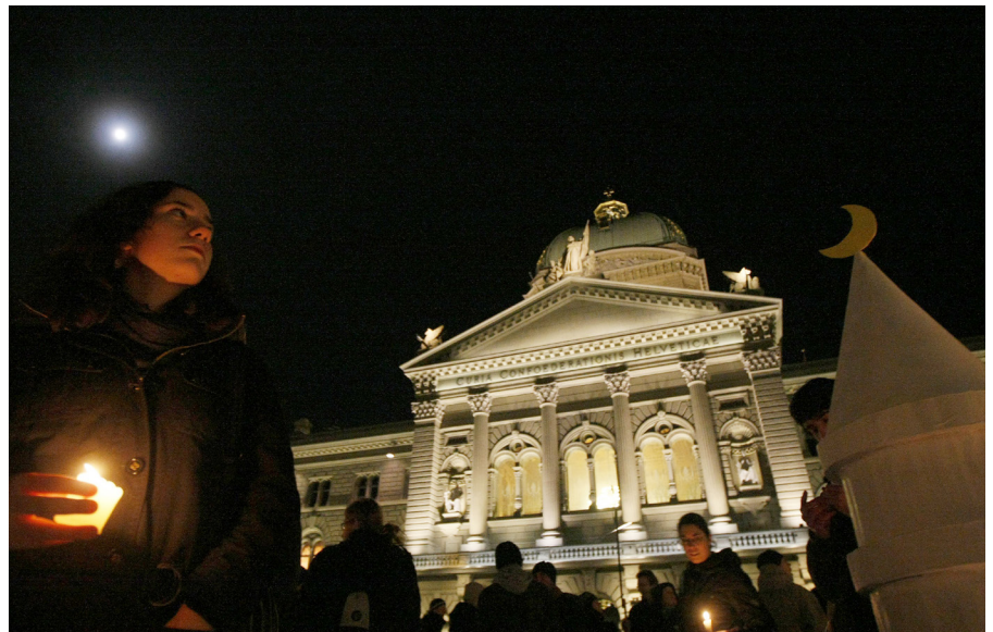
Protesters light candles after Switzerland bans the construction of minarets, on the Federal square in front of the parliament building in Bern, November 29, 2009.

How have the terrorist attacks and the attendant debate over the state’s countermeasures affected attitudes towards Islam and Muslims in Switzerland? This question is a relevant one, as empirical studies show that the experience of discrimination is an important motivating factor in jihadist radicalization. As recent surveys reveal, negative attitudes are prevalent in this country. In early 2017, as part of the study “ Sicherheit 2017 ” conducted by the Military Academy at ETH Zurich and the