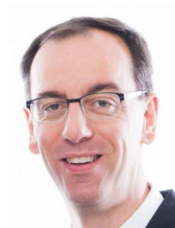
Helga Schmid Secretary General of the Organization for Security and Co-operation in Europe

“Such a MAS program can fill a clear gap in the current international training offered on peace mediation, by offering a longer duration professional training.”