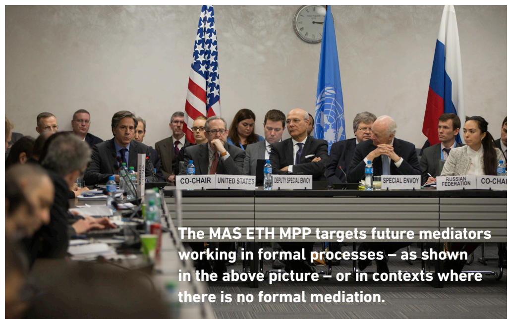
Deputy Secretary of State Antony "Tony" Blinken speaks at a meeting of the International Syria Support Group (ISSG) Ceasefire Task Force to express U.S. support for the ongoing effort to nurture the cessation of hostilities in Syria at the Palais de Nations in Geneva, Switzerland, on March 3, 2016.