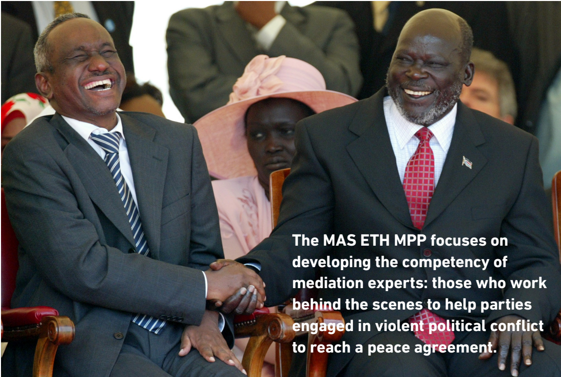
Sudan's First Vice President Ali Osman Mohamed Taha (L) and Sudan People's Liberation Movement (SPLM) leader John Garang (R) at the signing of the Comprehensive Peace Agreement on January 9, 2005, ending a 21-year-old conflict in the South that has killed an estimated two million people mainly through famine and disease.