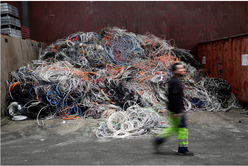
An employee walks next to isolated copper cables at the Metallum Group metal recycling company in Regensdorf, Switzerland, October 25, 2017.