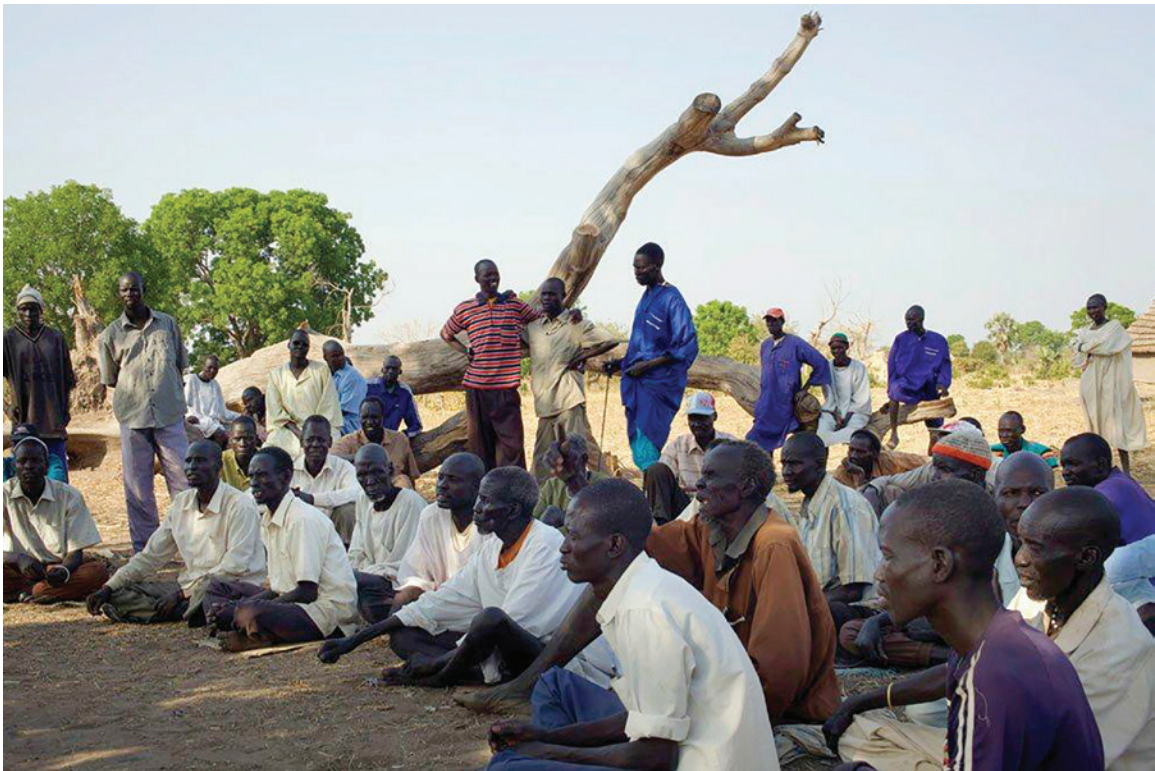
A traditional court in Warrap, South Sudan.

South Sudan's descent into civil war in 2013, 2 years after independence, has devastated families, communities, and institutions – including judicial institutions. Already fragile following decades of war against Khartoum, state institutions had yet to penetrate throughout the territory, and many were still in the process of formation. Areas that lay beyond the reach of the state were nevertheless not ungoverned. Traditional chiefs and the rich tapestry of tribal norms and rules they applied to resolve disputes have played an invaluable role in holding communities together, much as they had during the decades of North-South fighting in the Sudanese Civil War, despite the multiple challenges they faced.