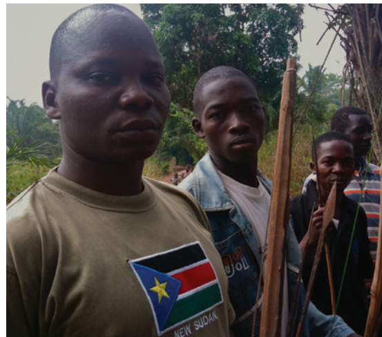
Members of the Arrow Boys militia in Western Equatoria.

With few peaceful interludes, South Sudan has been at war since 1955. It is not surprising the economy in the south effectively became a war economy as society grew progressively militarized and the security sector became the most active and lucrative sector. Ethnic rivalries fueled ethnic factionalism and led to proliferation of armed groups, most of which were excluded from the peace talks that led to the Comprehensive Peace Agreement (CPA) between the Sudan People’s Liberation Movement (SPLM) and the Government of Sudan.