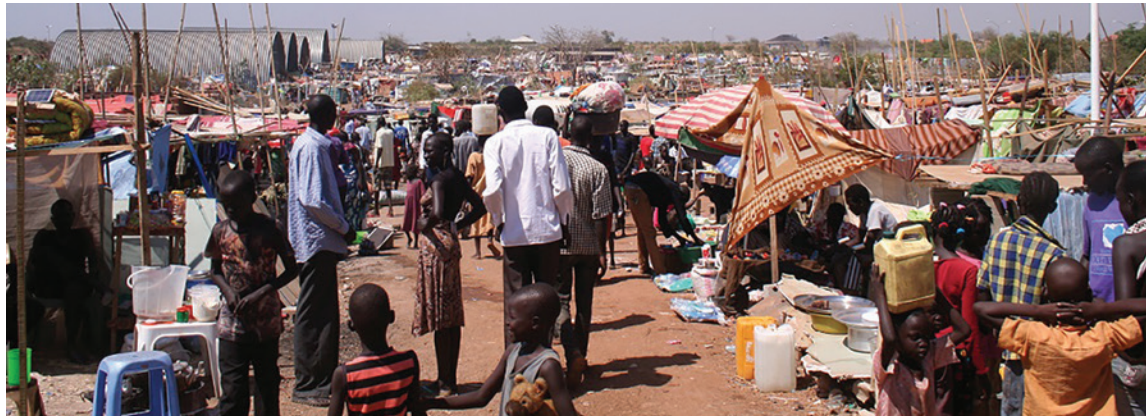
Internally displaced people shelter at a UN peacekeeping base in South Sudan.

In essence, under this scenario, the territory of what is currently South Sudan would revert to a stateless entity. There would be a period of massive death as famine and conflict ravaged the remaining population, which would exist on a much smaller scale and on a subsistence basis. The vast ungoverned space would also pose a regional security vacuum, potentially inviting proxy conflicts by regional actors seeking to exploit South Sudan’s resources while creating a buffer against instability on their borders.