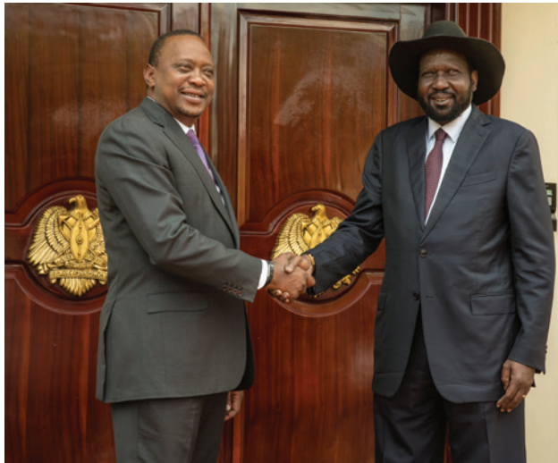
Presidents Kenyatta of Kenya and Kiir of South Sudan.

South Sudan's independence was granted reluctantly by Khartoum. This is wholly understandable considering that South Sudan's secession occasioned the loss of a quarter of Sudan's territory and three-quarters of its export earnings amounting to approximately $13 billion at the time of independence. 5 Soon after the partition, Sudan was forced to issue a new currency as the economy struggled with the permanent loss of more than a third of its revenue.