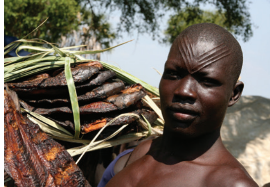
A Mundari fisherman in Terekeka, Central Equatoria State.

Instrumentalizing ethnicity for political gain often occurs in contexts where powerful actors see more relevance and efficacy in mobilizing along ethnic lines than along social classes. This is often related to the lack of desire of the ruling class for systemic change and the preference of elites – at various levels of society – for maintaining ethnically determined systems of production and consumption. As such, ethnicity should be understood as a political identity founded in social structures and reproduced by the institutions of the state.