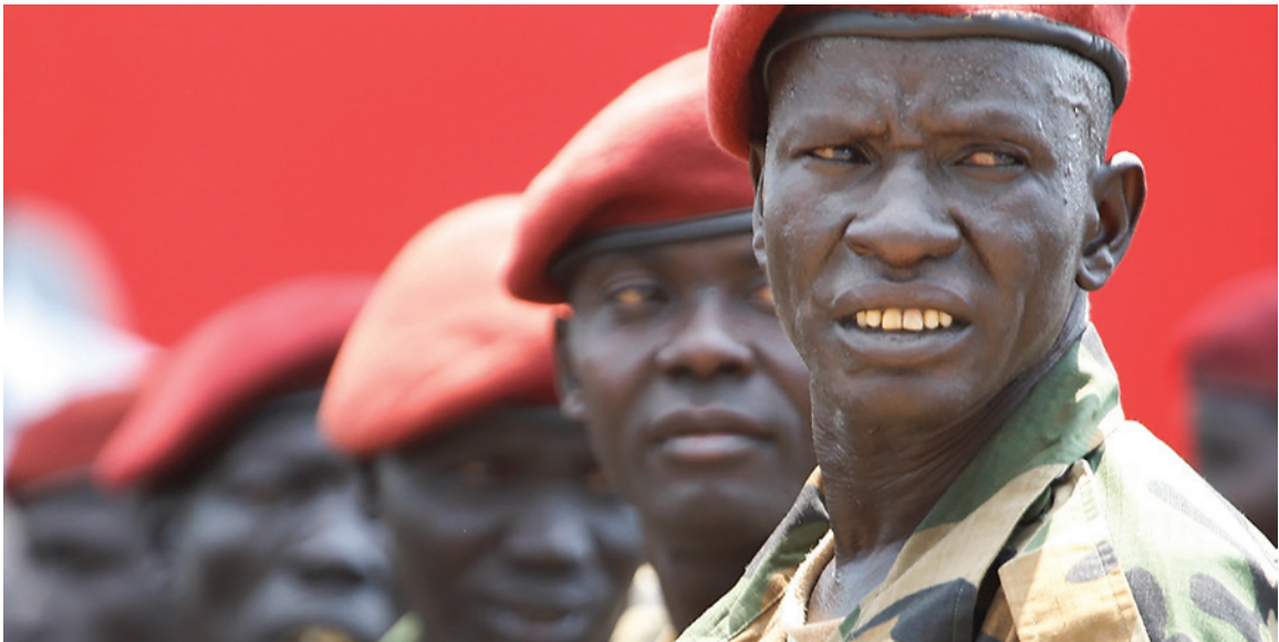
Members of the South Sudan presidential guard.