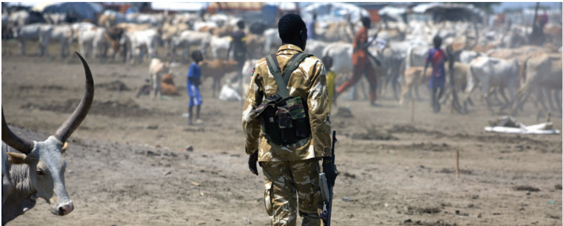
A South Sudanese soldier in Leer, South Sudan.

The status quo in South Sudan is unsustainable. South Sudan must undertake fundamental reforms if it is to avoid a descent into a Hobbesian state of lawlessness and rule by the strong.