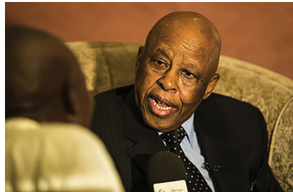
Festus Mogae

Beyond the ongoing conflict, there are several challenges that SSR efforts would need to overcome in order to gain traction. First, the near total absence of the rule of law and the resultant lack of confidence in security institutions poses multiple challenges for disarmament efforts. The failure of past SSR efforts is due, in part, to cyclical violence that make it difficult for armed elements to believe they can be safe without their guns. Due to the militarization of public life, bearing arms in South Sudan