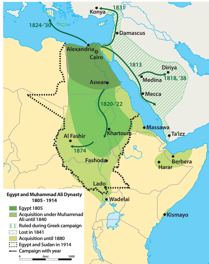
The reach of Muhammad Ali Pasha's Dynasty, 1805–1914.

With the resumption of the civil war in 1983, the nascent civilian and traditional institutions of public administration established in the semiautonomous South disintegrated or were ignored. As the war wore on and areas in the South were liberated, the military would dominate the administration, consequently paving the way for the gun class to flourish and to dominate the post-Comprehensive Peace Agreement (CPA) political order.