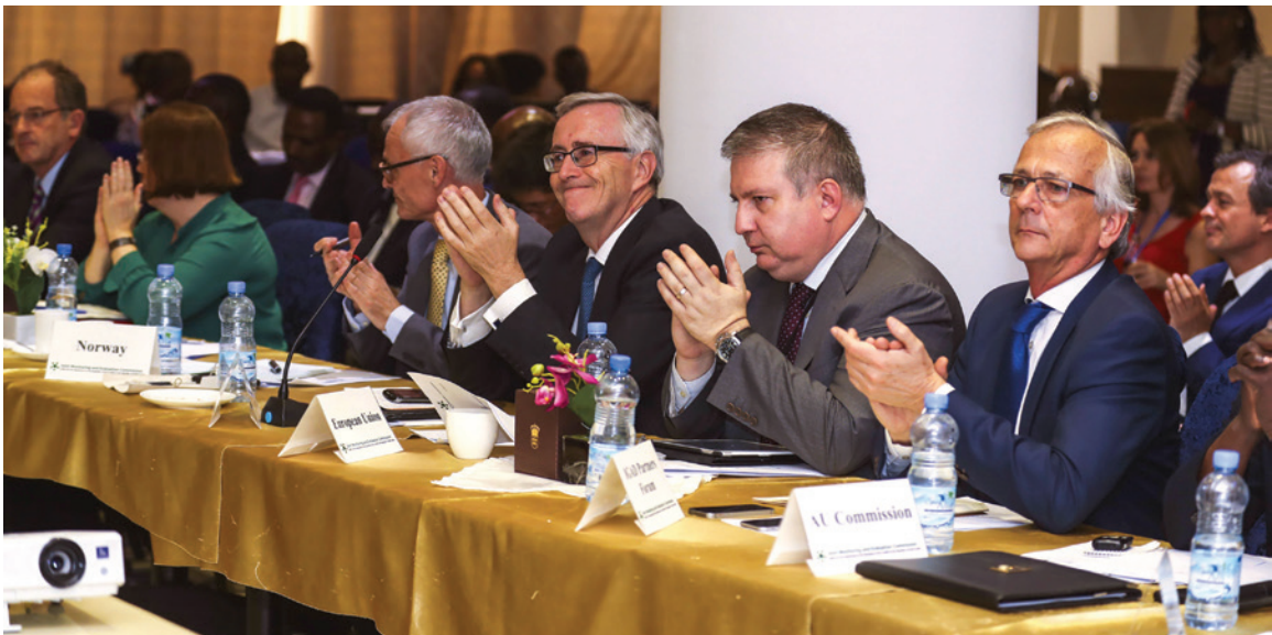
Plenary meeting of the Joint Monitoring and Evaluation Commission (JMEC) on March 15, 2017.

International actors should actively work toward resetting the levers of structural power within the political economy so that a less violent South Sudan is possible.