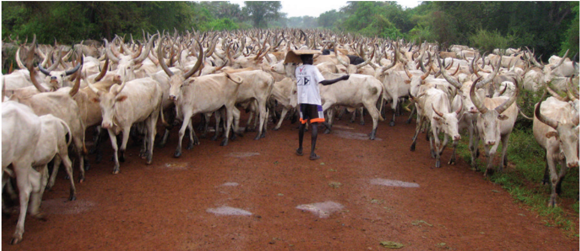
A herd of cows on the road to Bor, South Sudan.

When South Sudan achieved independence in 2011, the Sudan People's Liberation Army/ Movement (SPLA/M) and its leader, Salva Kiir Mayardit, took control of a system of governance that transcended the lines between the formal and informal sectors, military and civilian elites, government and nongovernment actors, as well as licit and illicit sources of revenue. Instead of laws, rules, regulations, and rights, South Sudan is governed through complex personal and familial ties with an uncertain fluidity. A military aristocracy was established that maintains its strength through patrimony made possible via resource capture. 1 The SPLA/M was legitimized as liberators, and warlord-style rebel leaders were elevated to the top of a ruling class characterized by ethnicity.