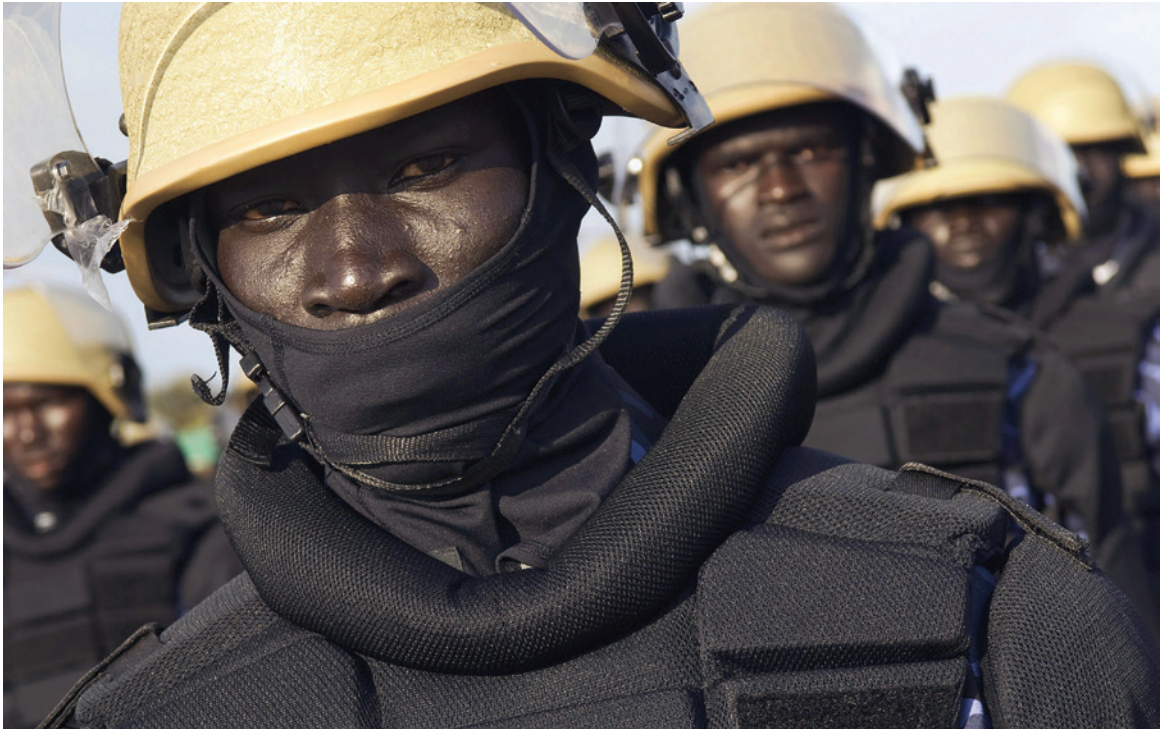
South Sudanese police recruits at training academy.

Countries emerging from conflict confront numerous challenges relating to the reform of their security sectors. Some countries succeed in addressing those challenges, are able to reform their security sector gradually, and achieve peace and stability for their people as a consequence. Other countries fail to do so, at times contributing to the recurrence of conflict. South Sudan falls into the second category of countries. Following the signing of the Comprehensive Peace Agreement (CPA) in 2005, the parties failed to live up to their commitments, which included reducing the size of their militaries. It was not surprising, therefore, that the failure to carry out meaningful reforms of the Sudan People's Liberation Army (SPLA) in the post-CPA period had some bearing on the eruption of the crisis in December 2013.