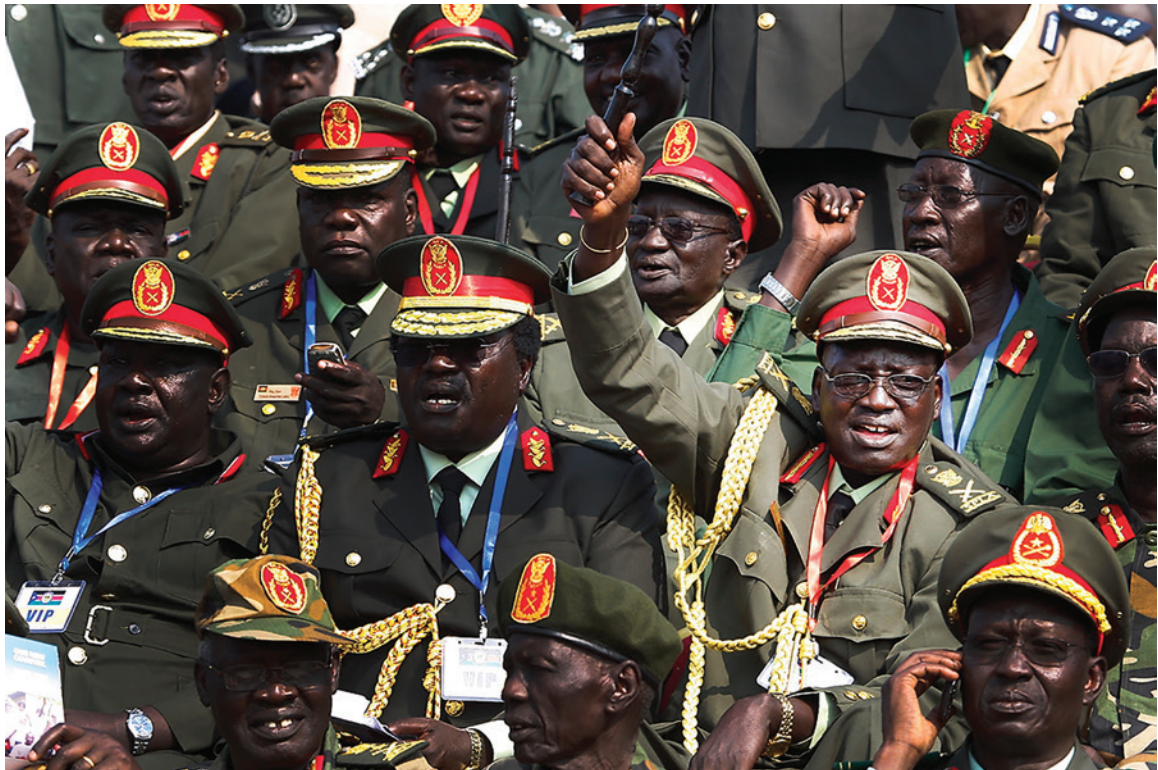
Generals of South Sudan's army celebrate during official Independence Day ceremonies.

The 2015 Agreement on the Resolution of the Conflict in the Republic of South Sudan (ARCSS) identifies security sector reform (SSR) as one of the most crucial issues that need to be addressed if South Sudan is to attain peace. The prioritization given to SSR in the ARCSS is illustrated by the fact that it comes immediately after the provisions relating to the establishment of the Transitional Government of National Unity (TGoNU). As a building block to SSR, the ARCSS mandates a Strategic Defence and Security Review (SDSR) to be undertaken by a multistakeholder Strategic Defence and Security Review Board (SDSRB). 1 The SDSR process should generate a comprehensive SSR framework, which when implemented, will radically transform the security sector in South Sudan.