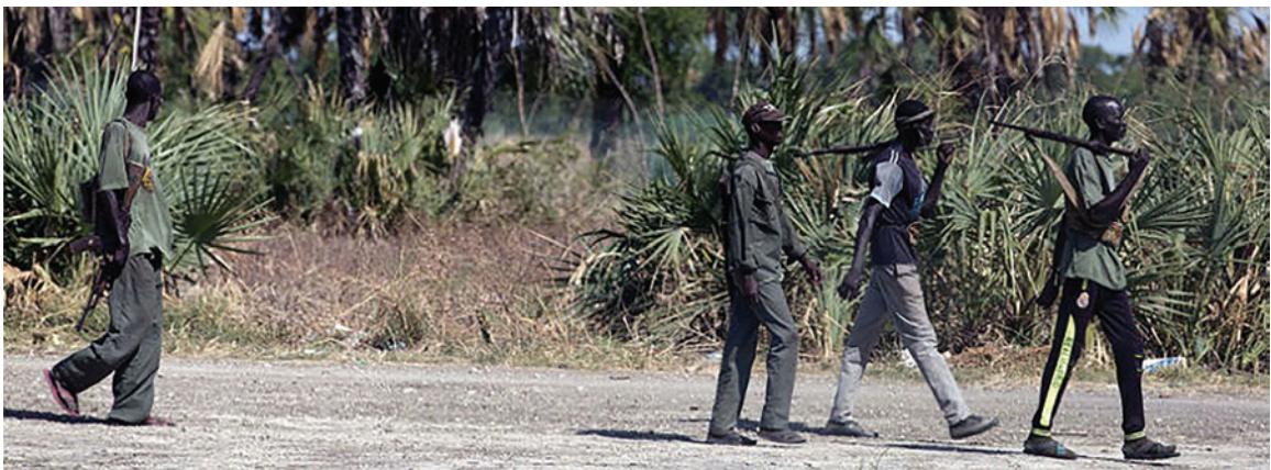
Fighters in Leer, South Sudan.

A “gun class” – the fusion of security leaders with political power, class, and ethnicity – is at the heart of the predatory governance system that has taken root in South Sudan. Changing this trajectory will require redefining the roles of political and security actors.