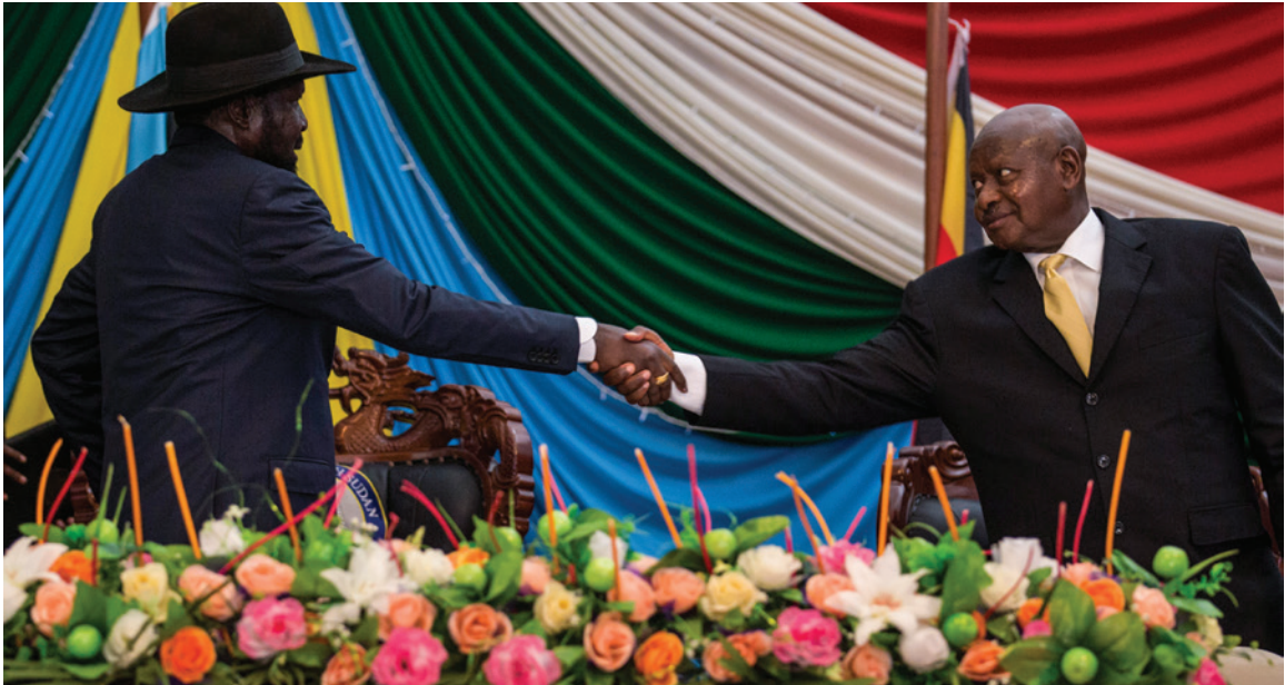
South Sudanese President Salva Kiir and Ugandan President Yoweri Museveni at the signing of the Agreement on the Resolution of Conflict in the Republic of South Sudan (ARCSS), August 26, 2015.

Regional considerations have always played a prominent role in South Sudan's security landscape. Indeed, the country was born from a regional fissure between what are today Sudan and South Sudan. This schism has been subsequently shaped and influenced to varying degrees by all of South Sudan's neighbors. These dynamics have continued with the country's descent into civil conflict in December 2013. These influences have had both exacerbating and stabilizing effects, adding another layer of complexity to the political calculations of any peacebuilding efforts in the region. Understanding and navigating these regional dynamics, on both a bilateral and multilateral level, is part and parcel of achieving durable stability in South Sudan.