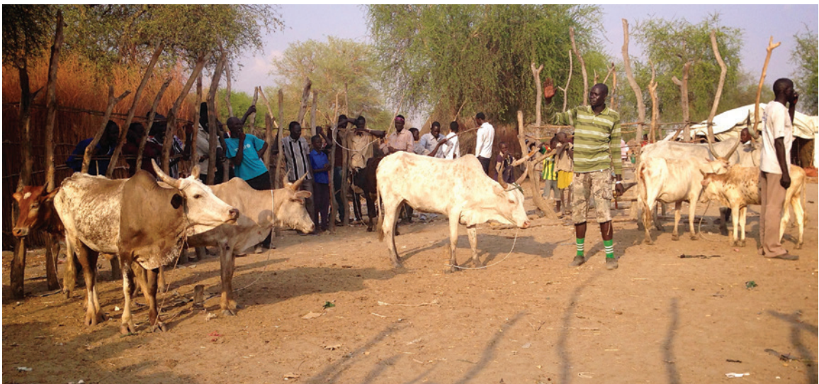
A cattle auction in Lankien, South Sudan

Decentralization must physically expand the range of choices people have on the ground to step back from the patronage-based economic networks that operate within ethnically defined units. Indeed, many South Sudanese assert that the most obvious impediment to national cohesion is exclusion from the national platform, especially exclusion along ethnic lines. 9 Formalizing terms of trade, regulating market behavior, and expanding access to credit, particularly in the form of cattle banks, could begin to dilute the importance of patrimony and ethnicity for access. In illicit and informal economies profit is generated and contained in closed networks that are often ethnically determined.