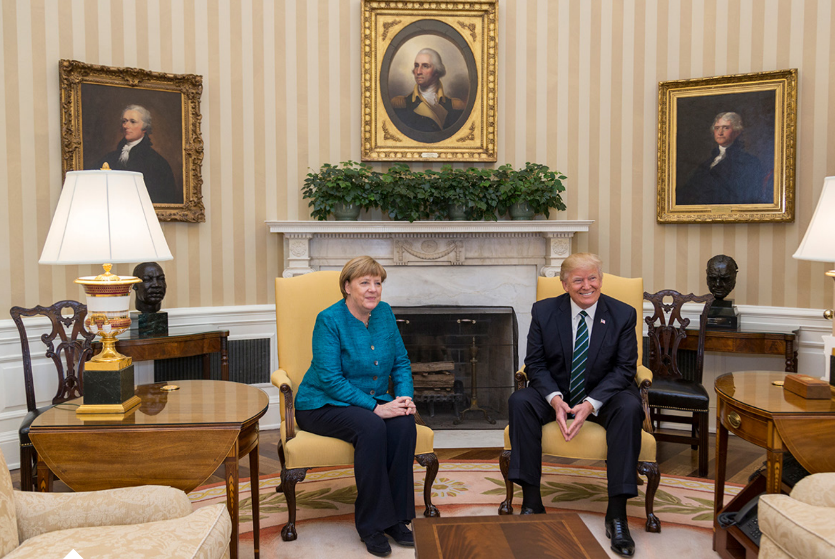
President Donald Trump meets with German Chancellor Angela Merkel during his first one hundred days in office.

percent of Germans favored higher defense spending with 55 percent against. 9 While Germany is on course to contribute a greater share to common European defense, making a case to the German public for troop deployment in foreign conflicts will be difficult and will require political leadership—irrespective of the defense budget. Given this political reality, German defense policy will likely continue to focus on training the forces of partner states or partner groups fighting in conflict, rather than engaging in direct conflict.