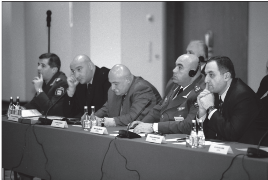
Georgian delegation at the Workshop

Uncontrolled Abkhazia is also a big economical problem. This uncontrolled