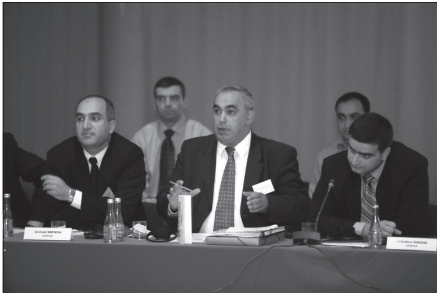
Armenian delegates during the discussions

tion policy will contribute to the relief of tension and improvement of mutual confidence. As you can, see we co-operate with countries and security systems the policy of which can be even assessed as contradictory. We aim at balancing the interests of all military-political powers,