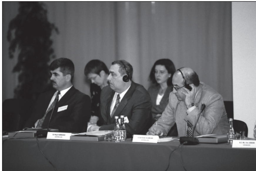
Delegates of Azerbaijan during Workshop discussions

To further understand PfP's goals and missions among soldiers, in particular among young officers, the NATO/PfP Department has been established in the Azerbaijan High Military Academy. It provides a training programme for cadets undergoing 3 rd and 4 th year training.