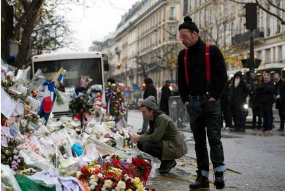
Paying tribute at a makeshift memorial in front of the Bataclan concert hall in Paris, site of the November 13, 2015 terror attack.

In the latter half of the 1980s, Shiite organizations, and especially Hezbollah, joined the growing terrorist activity in Europe, under the auspices of the Islamic Republic of Iran and with its active support. The Shiite terrorist organizations added a new and particularly deadly modus operandi to the international terrorist repertoire, namely suicide bombings. Under their influence suicide bombings became a dominant mode of attack, and as such was adopted and further developed by many other terrorist organizations, due to the extent of damage it causes, and even more, due to the fear that it instills. 3 From the second half of the 1990s, the Salafi jihadist organizations, such as al-Qaeda and its affiliates and in recent years the Islamic State as well, which are all members of the global jihad movement, joined the terrorist activity in Europe. 4