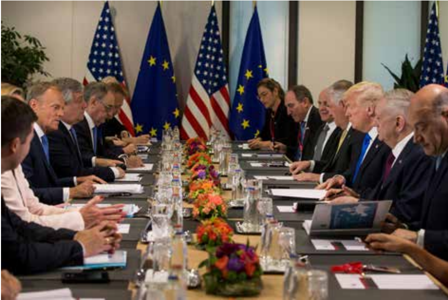
US President Donald Trump with EU High Representative for Foreign Affairs and Security Policy Federica Mogherini, European Council President Donald Tusk, and others at a NATO meeting, Brussels, May 25, 2017.

elites only, and harm the national identity of the member countries as well as their borders, security, and economies. This approach, which has spread in the West and especially in Europe, peaked with the exit of Britain from the EU and the growing electoral success of populist nationalist far right and Eurosceptic parties, such as the National Front in France led by Marine Le Pen. The leadership in Europe, led by German Chancellor Merkel and French President Macron, has identified these movements as the main threat to Europe's stability at this point in time.