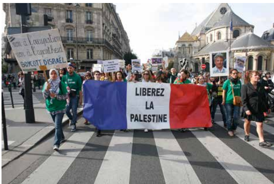
Pro-Palestinian demonstration, Paris, October 10, 2015.

under its global banner results in heightened focus on small scale activities with minimal to non-existing impact, creating a skewed picture of an oversized, imminent threat to Israel's international standing.