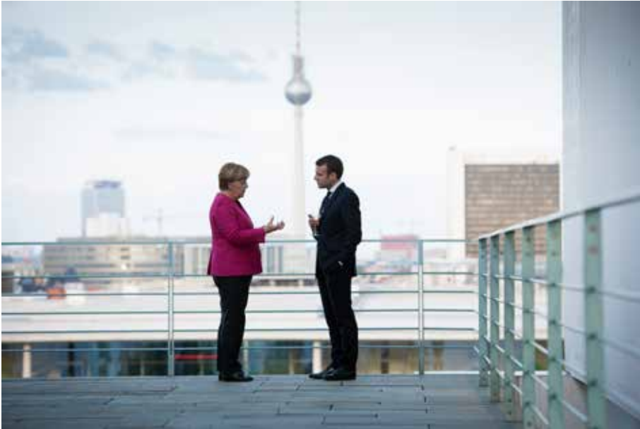
French President Emmanuel Macron and German Chancellor Angela Merkel, Berlin, May 15, 2017.

that the nation-state arrangement wrought on Europe – is in doubt, in view of the trend of renationalization that is widespread among EU members, primarily those admitted most recently.