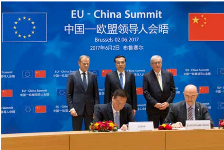
Signing ceremony of several agreements between the European Union and China, during the EU-China Summit at the European Council in Brussels, June 2, 2017.

economy. This allows any country to use anti-dumping measures against it, which according to the organization's rules include raising tariffs and restricting imports. However, it was also agreed that within some 15 years, subject to the economic reforms to be carried out in China, it would receive the status of a market economy. Since Europe and the US constitute the main markets for China's products, their decision on the subject is important to Beijing, which is applying immense pressure in order to have its status changed. In this context, the government of China submitted a complaint in 2009 to the WTO's dispute settlement mechanism concerning the anti-dumping measures taken by the EU against Chinese steel products. Although it rejected most of China's claims, a panel of WTO judges decided that indeed in some of the cases the EU did not act according to the WTO charter. 3