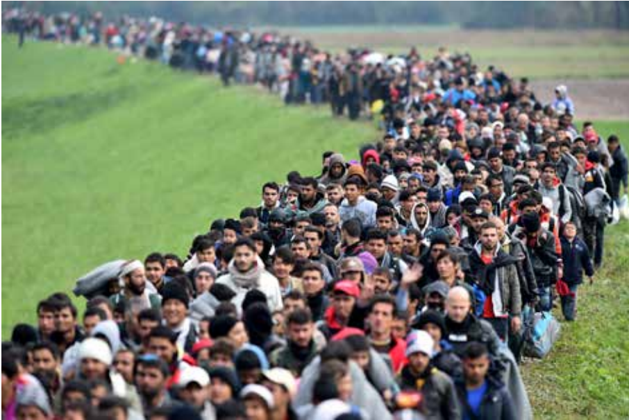
Migrants escorted by police as they are walked to a refugee camp in Slovenia, October 23, 2015.

tragic dimensions of the plight of the asylum seekers, and there was now a greater willingness to open the gates of Europe to hundreds of thousands of individuals. However, at the same time, other sentiments, namely, xenophobia (primarily against Muslims) and violent national patriotism began to rise to the surface in Europe.