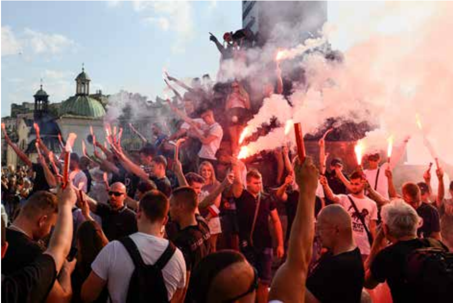
Far right nationalists in Krakow light torches during a ceremony commemorating the 73rd anniversary of the Warsaw Uprising, August 1, 2017.

social phenomena, most of which are the outcome of globalization, namely loss of jobs due to open markets; the lack of personal security and the threat to local identity due to the presence of non-European immigrants; the constraints on freedom of expression due to the need to be politically correct; and reduced national sovereignty as a result of the concentration of political power in supranational institutions. 5