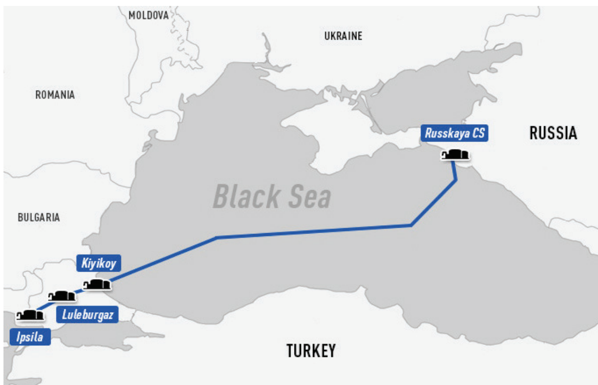
Figure 2: Turkish Stream, a natural gas pipeline running from Russkaya compressor station to Kiyiköy, Turkey across the Black Sea 37

By providing gas export via a Turkish Stream across the Black Sea, Russia achieves several strategic objectives. On the one hand, Russia strengthens its position in the Black Sea region and in the European energy market, with countries such as Turkey, Greece, and Italy. On the other hand, Russia is able to project energy power towards South-Eastern Europe and the EU and to use this regional energy dependence power as leverage for its own purposes. In this sense, Turkish Stream and Nord Stream 2 are two important regional gas initiatives for Russia