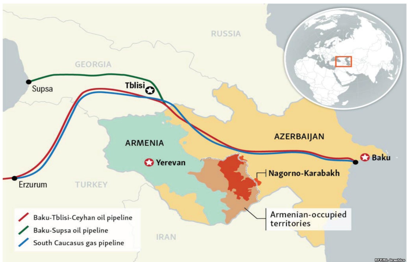
Figure 3: Key transit energy routes running to Europe, located close to the Nagorno-Karabakh disputed area 41

the conflict around the disputed Armenian-held enclave endangers Baku’s energy export route across the Caucasus. 39 Two pipelines transporting oil and gas from Azerbaijan westwards are located near the Nagorno-Karabakh frontlines, putting them within reach of both Russia’s influence and of weapon systems supplied to the warring parties should the Kremlin decide to take direct action. Closing this energy route would severely decrease Europe’s hopes to reduce its dependence on Russian energy sources. 40