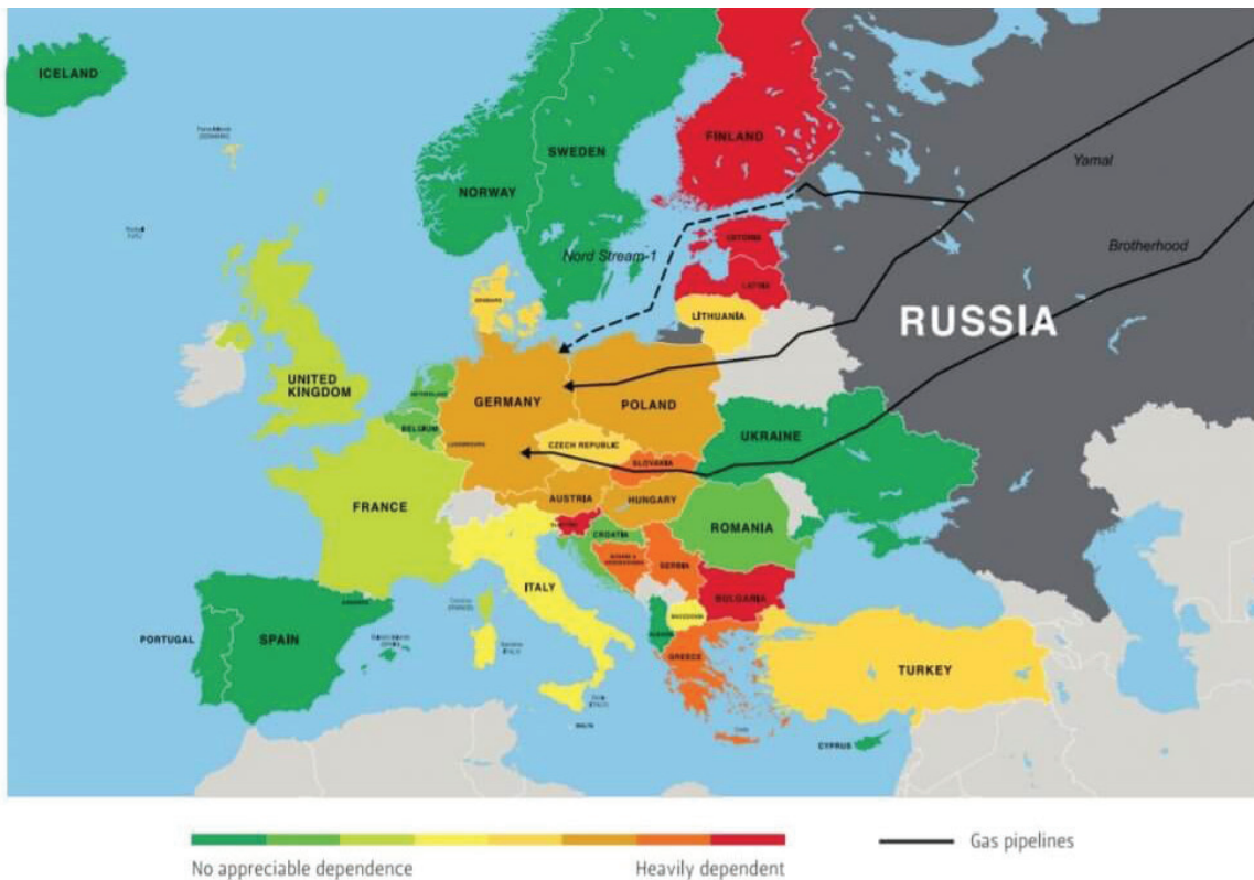
Figure 1: European countries' dependence on Russian gas 17

As seen from the map, a large majority of the Eastern European countries, the Baltic States, Finland and Bulgaria are exposed to hybrid actions in a form of energy manoeuvres, and accordingly to economic or political coercions, politically motivated energy supply disruptions and gas price disputes. The key energy transit countries to Europe, such as Ukraine, Georgia or Belarus, are largely exposed to energy weaponization, energy blackmailing or other forms of geopolitical or psychological pressures that reveal their vulnerabilities.