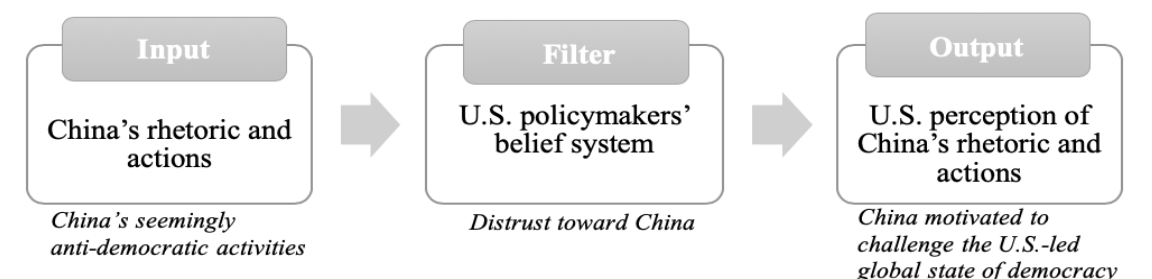
FIGURE 3. U.S. Perceptions of China's Seemingly Anti-Democratic Activities

fundamental attitude of suspicion of China's behaviors. With distrust at heart, the United States will likely doubt and ignore goodwill gestures from China, whereas China's ambitious, if not assertive, actions will likely be taken at face value.<sup>20</sup> The United States therefore filters China's seemingly anti-democratic rhetoric and actions through distrust, convincing itself that China is motivated and prepared to challenge the U.S.-led global state of democracy (see Figure 3 below).