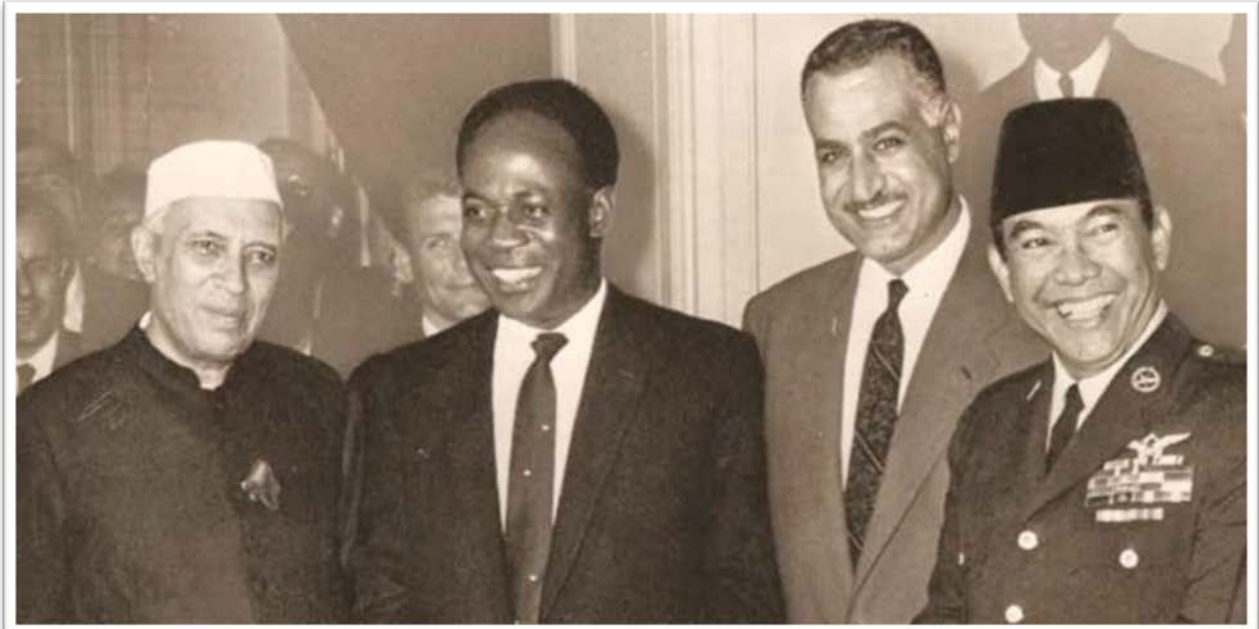
Mission accomplished? — Postkoloniale Staatsoberhäupter der ersten Generation im Jahre 1961: Nehru (Indien), Nkrumah (Ghana), Nasser (Ägypten) und Sukarno (Indonesien).