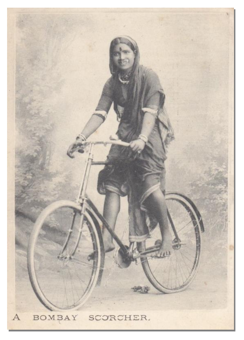
En route to modernity? — Indian Postcard (1906)