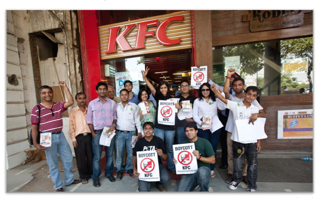
Representing the 'twittering classes'? Protesters against Kentucky Fried Chicken in New Delhi (2010)