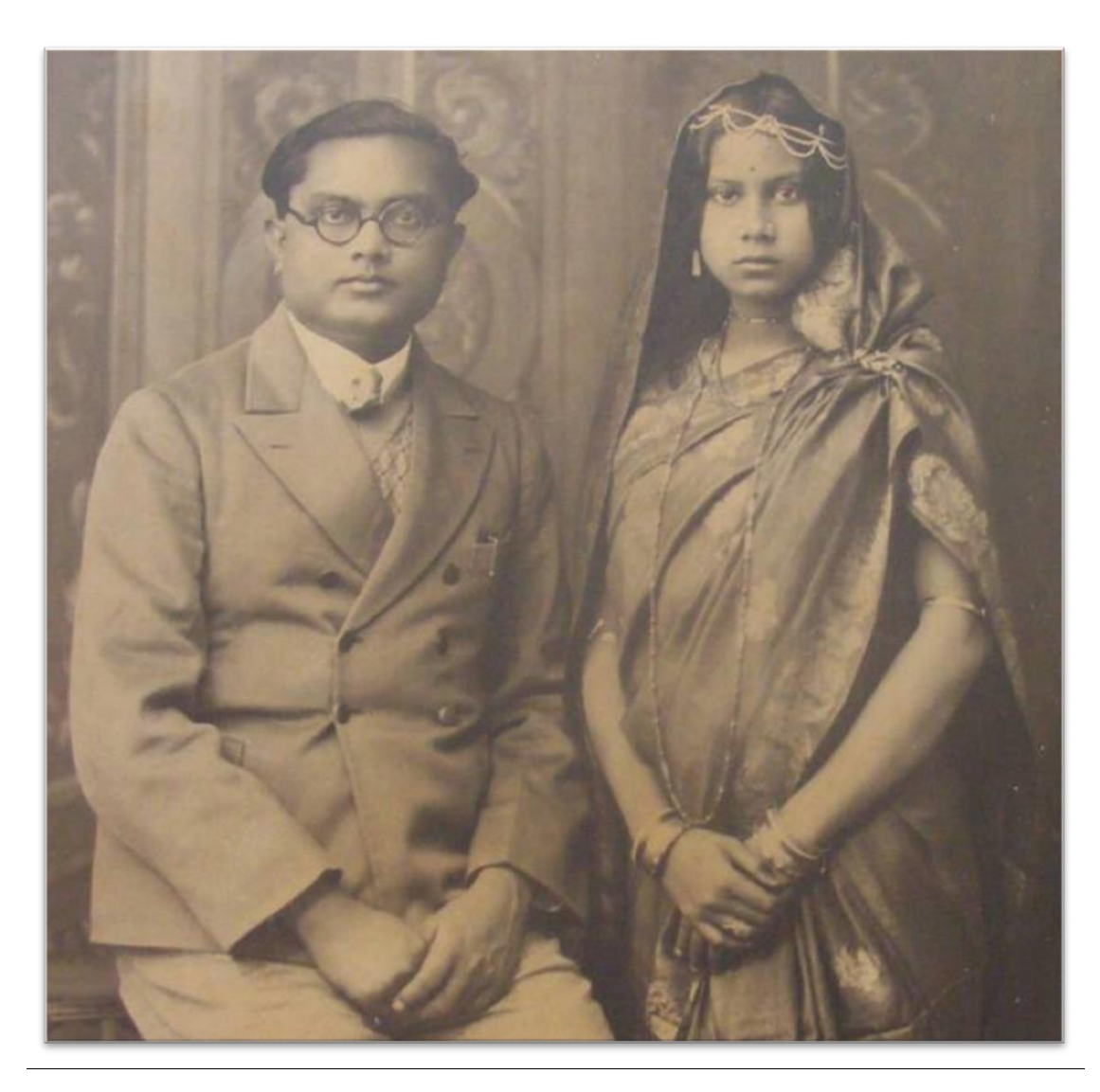
Gendered appropriation of Modernity? A Bengali married couple (c. 1920)