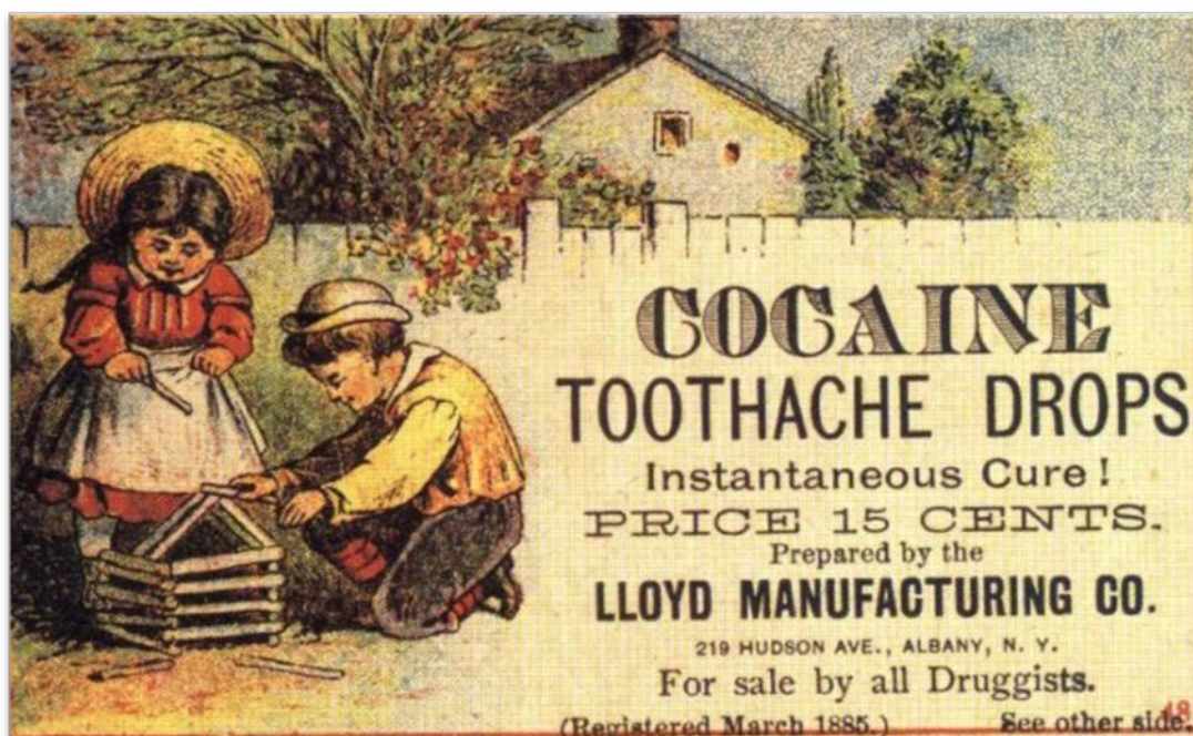
Advertisement for cocaine enriched toothache drops, USA 1885