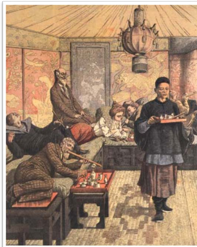
Contemporary representation of an 'opium den' in late Victorian London