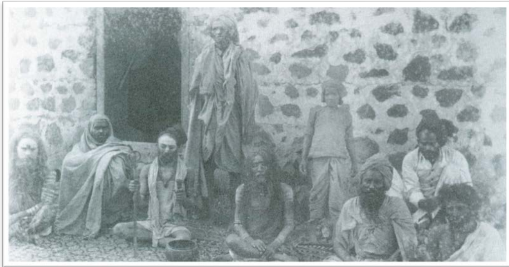
Indian Cannabis consumers. Illustration in the report of the 'Indian Hemp Drug Commission' 1894