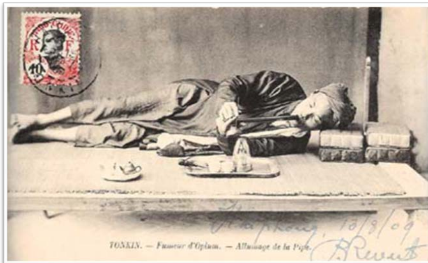
Opium-smoker in Vietnam, French postcard (1909)

This course will look at the historical trajectory of the interaction between the politics of colonial or quasi-colonial empires and the cultivation, trade, and consumption of mood altering substances in the period between roughly 1700 and 2000. Apart from the economic aspects of drug-trafficking, cultural and social consequences of production and consumption on both sides of the imperial divide are put under scrutiny. The course aims at providing historical background knowledge regarding the controversies about drugs and the fight against them. It is designed to enhance the students' capability to deconstruct normative discourses, thereby fostering their analytical skills and sharpening their critical acumen. The subject matter does not only relate to problems of a mere historical nature, as the topic under study still is of critical relevance today. Students are expected to be present in 80% of the sessions, take part in the discussion of the weekly mandatory readings, prepare an individual or group presentation and submit the written summary of a survey text.