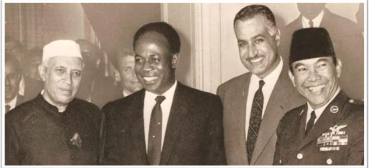
Mission accomplished? — Postkoloniale Staatsoberhäupter der ersten Generation im Jahre 1961: Nehru (Indien), Nkrumah (Ghana), Nasser (Ägypten) und Sukarno (Indonesien).