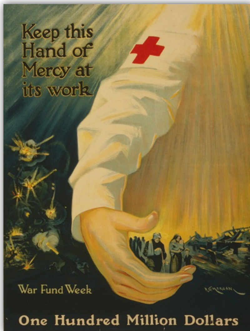
Poster published by the American Red Cross during World War I