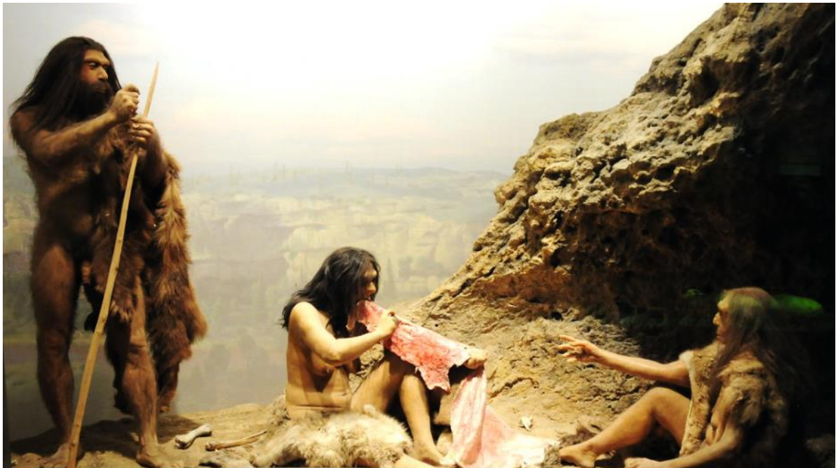
Anne and Bernard Spitzer Hall of Human Origins, American Museum of Natural History