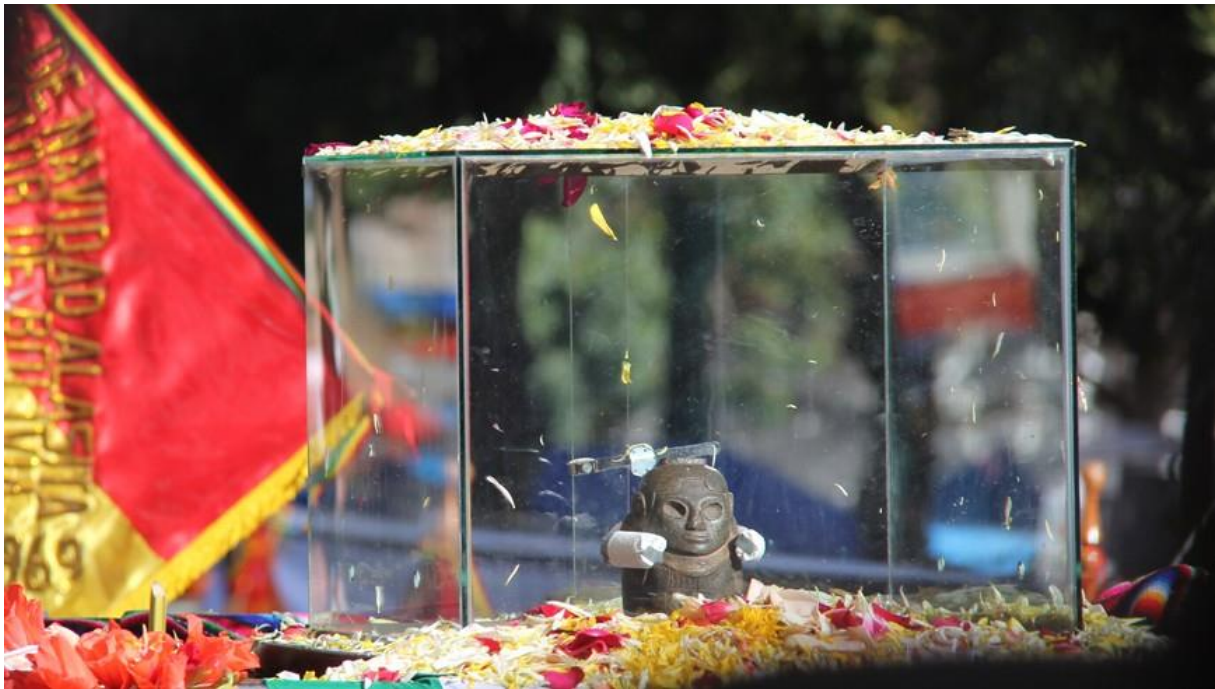
“Berner” Ekeko’s illa in Bolivia.