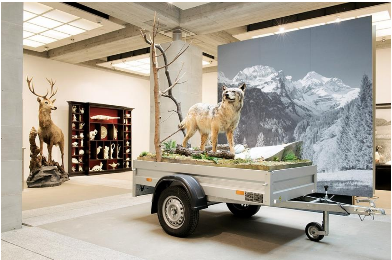
Mark Dion · Mobile Wilderness Unit - Wolf, 2006, diverse Materialien, Georg Kargl Fine Arts Vienna, Kunstmuseum St.Gallen.