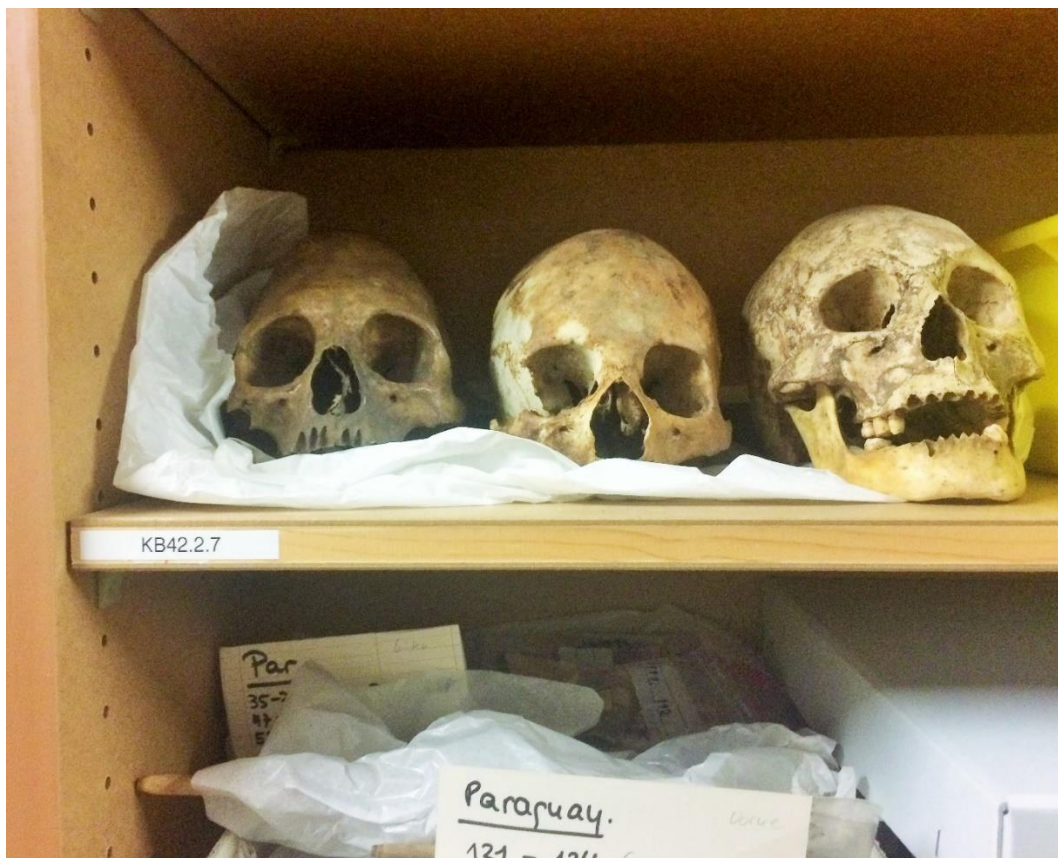
Storage in Historisches Museum.

Technical Support: rahel.gutmamm@gmw.gess.ethz.ch