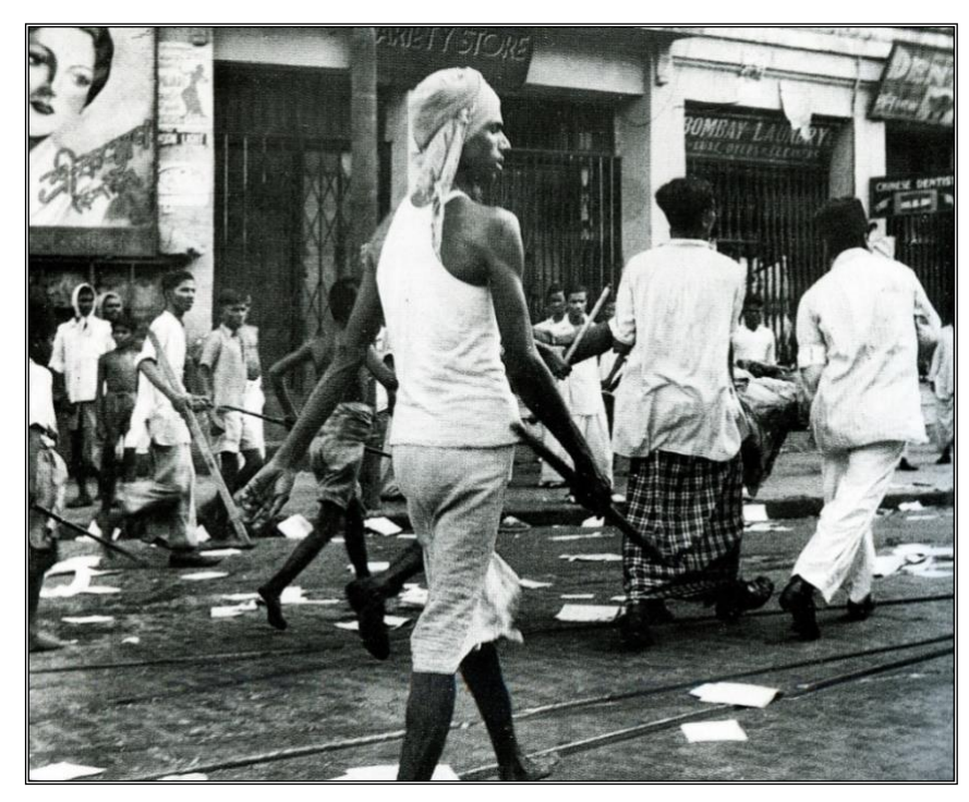
Hindu-Muslim riots during the infamous , direct action day' in Calcutta, August 1946