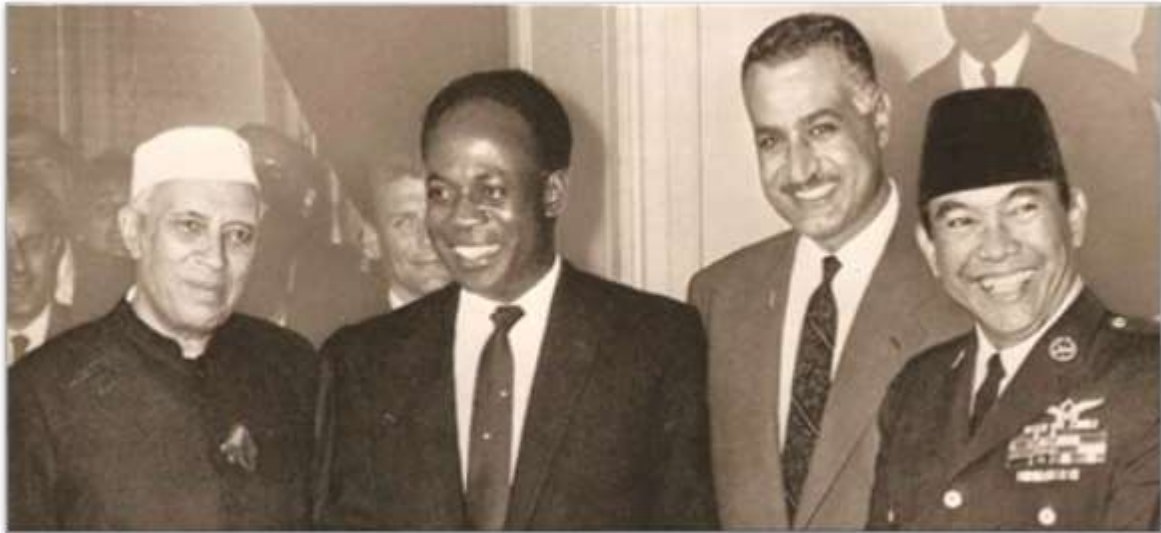
Mission accomplished? — Postkoloniale Staatsoberhäupter der ersten Generation im Jahre 1961: Nehru (Indien), Nkrumah (Ghana), Nasser (Ägypten) und Sukarno (Indonesien).