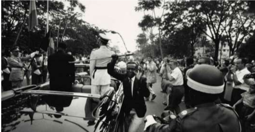
Leopoldville, Belgisch-Kongo (1960)