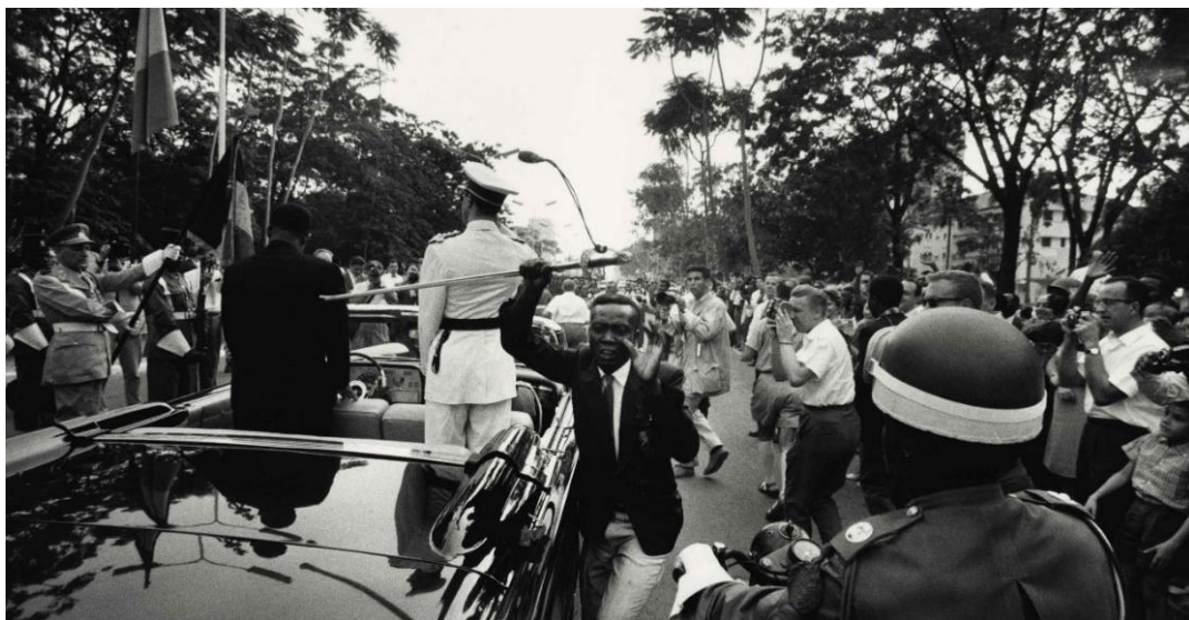
Leopoldville, Belgisch-Kongo (1960)