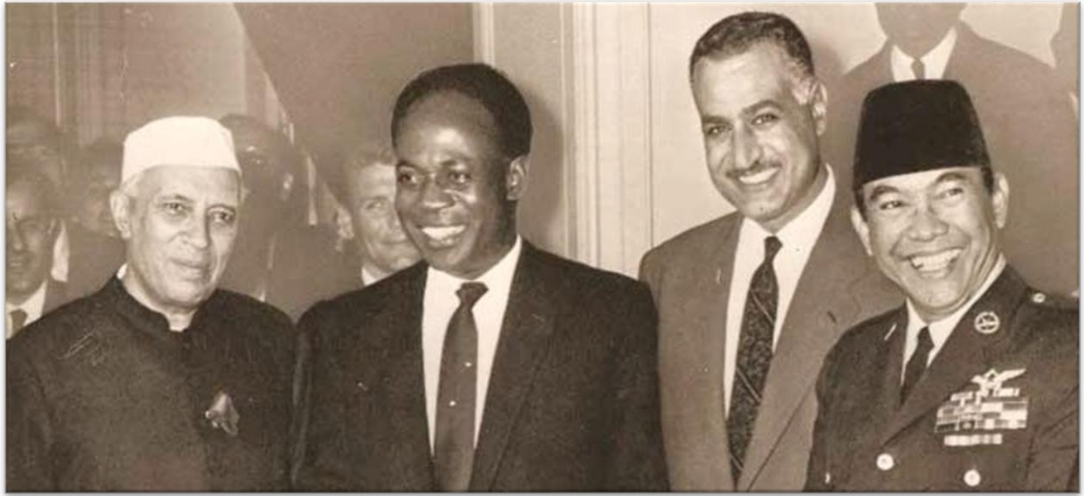
Mission accomplished? — Postkoloniale Staatsoberhäupter der ersten Generation im Jahre 1961: Nehru (Indien), Nkrumah (Ghana), Nasser (Ägypten) und Sukarno (Indonesien).