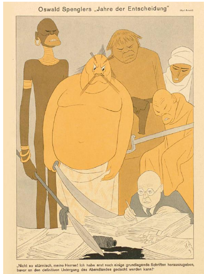
The decline of the West: cartoon portraying Oswald Spengler as the prophet of doom