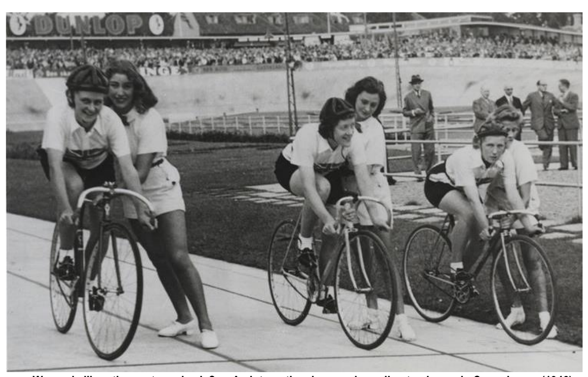
Women's liberation on two wheels? — An international women's cycling track race in Copenhagen (1946)