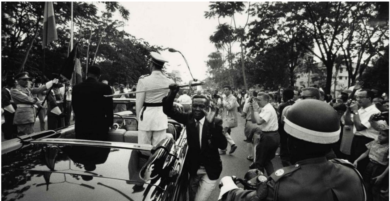
Leopoldville, Belgisch-Kongo (1960)