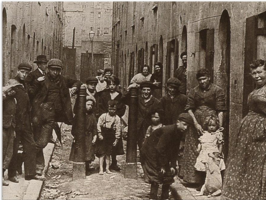
Strassenszene aus einem Londoner Arbeiterviertel