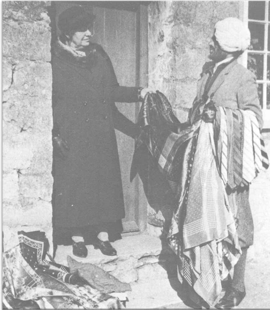
«The Empire's coming home»: Indischer Händler in Nordengland (um 1920)