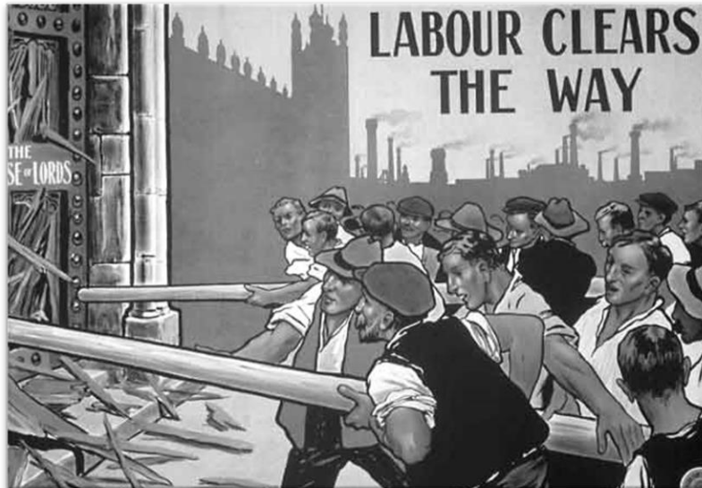
Builders of a new society? Poster der Labour Party (1909)