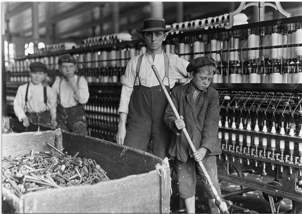
„An age of machinery“: Blick in eine englische Baumwollspinnerei (ca. 1910)