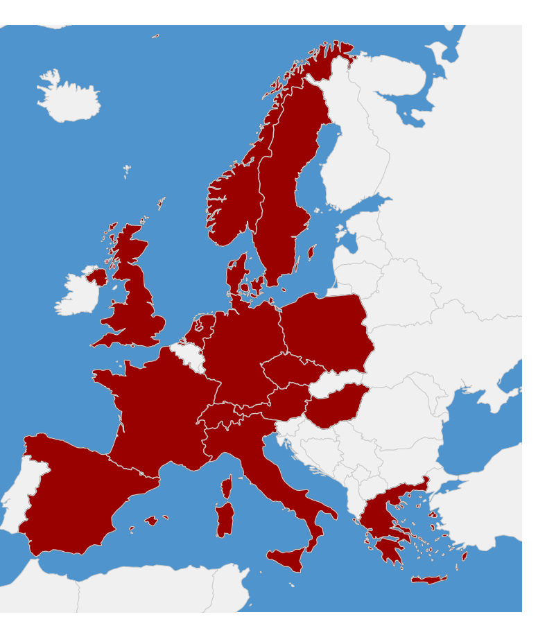
18,000 people were surveyed in 15 countries.

We randomly assigned manipulations to see which holds sway. When respondents were informed of the options presented—the status quo, proportional allocation, and an equal number of asylum seekers for each country—majority support for proportional equality remained nearly unchanged. This suggests that the norm is so widely shared, and so intuitive, that it doesn't need to be explained. And when respondents were told how many asylum seekers each option would send to their country, allowing them to easily pick the one with the lowest number, proportional allocation saw decreased support in most countries but still won a 56% majority.