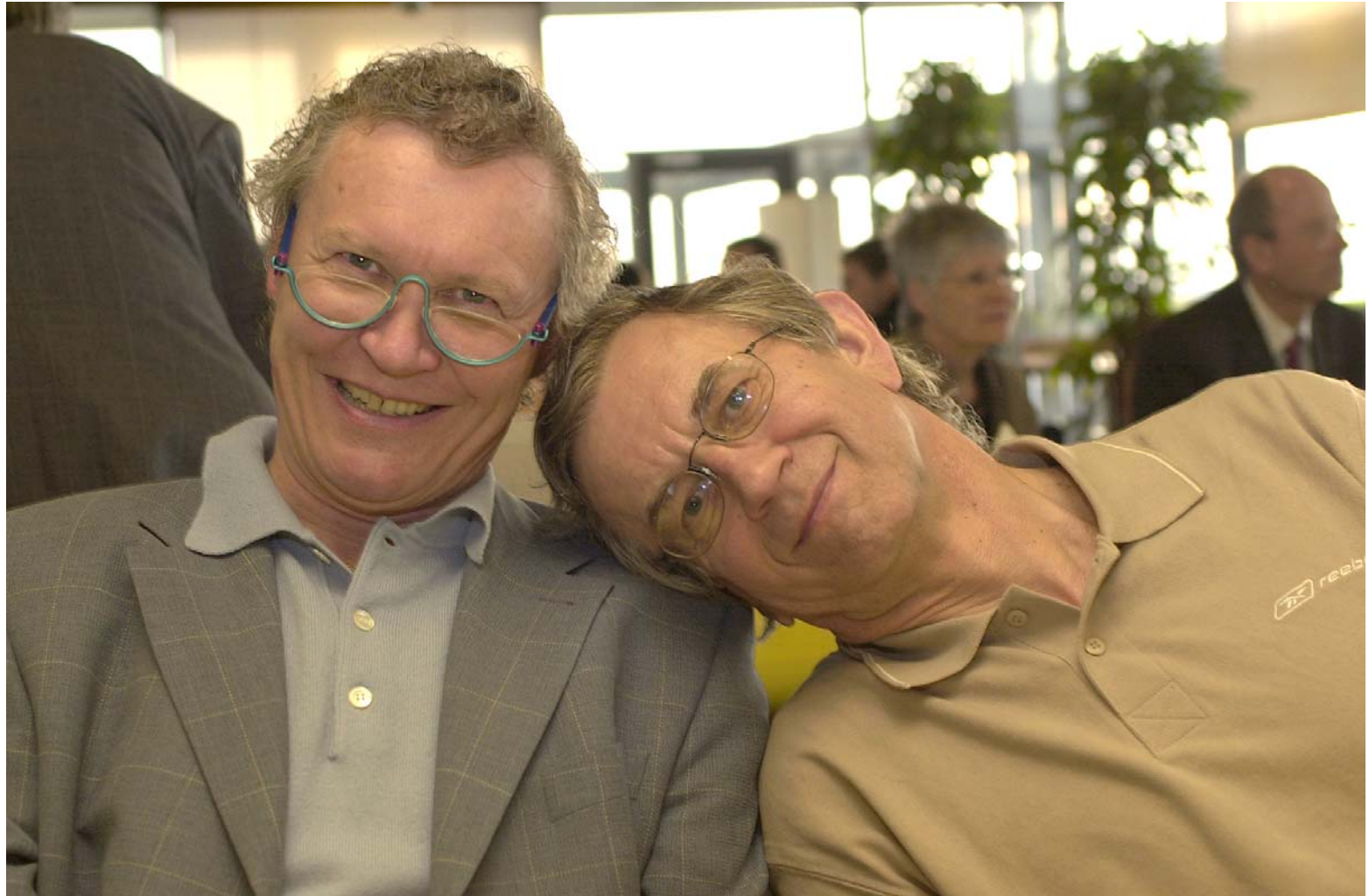
Scientist supported by Photographer (the One, who took the Pictures)