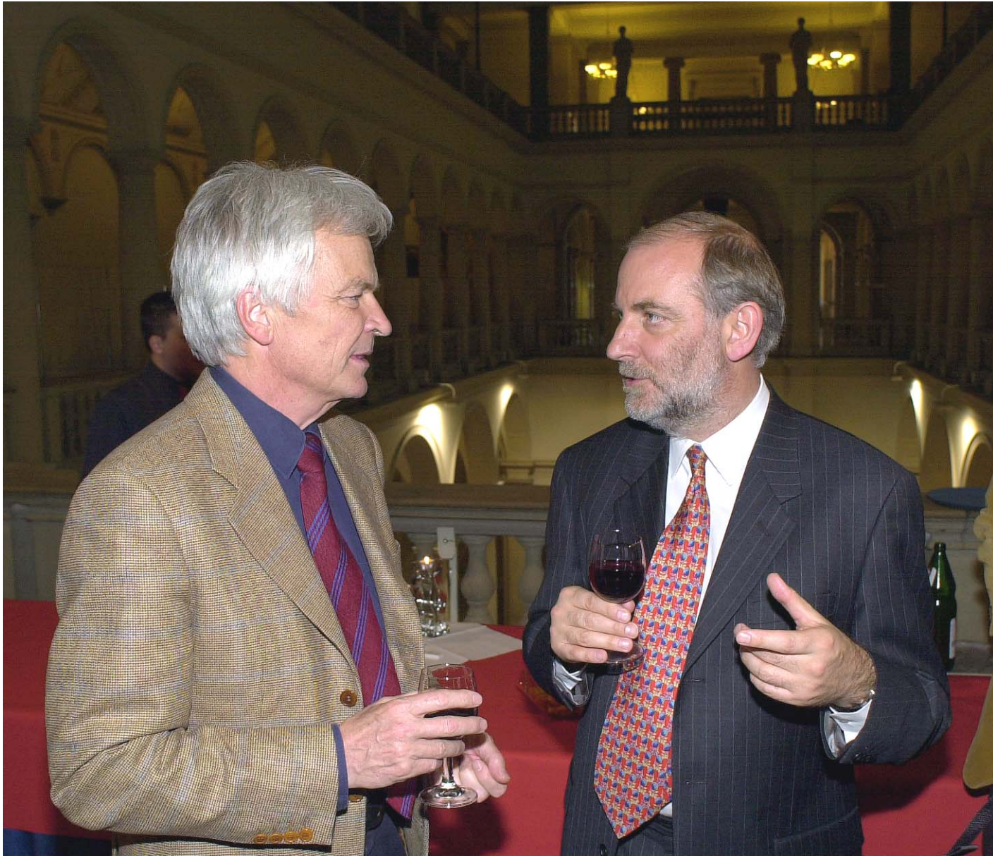
President's Visit; what an Honor!