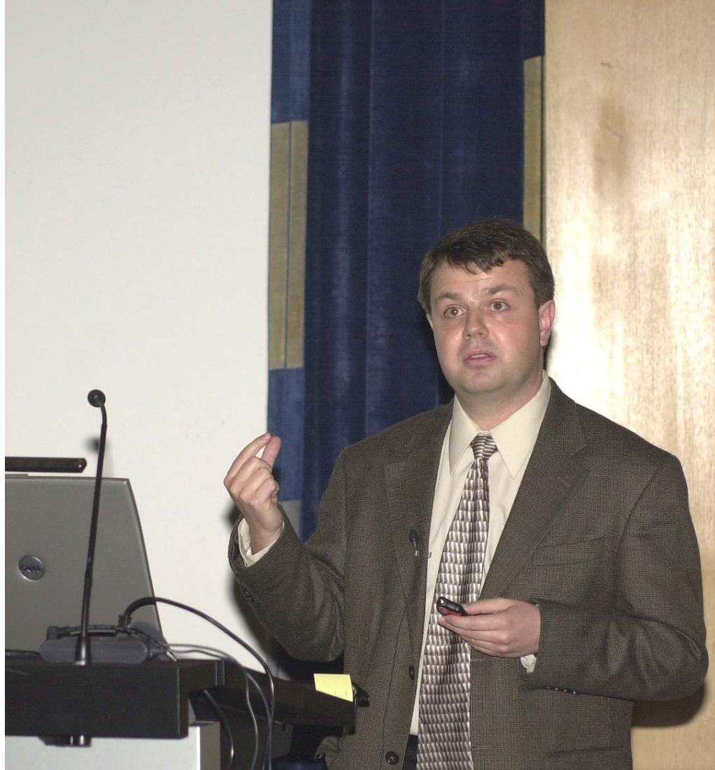
Talking about the Size of a Nanometer