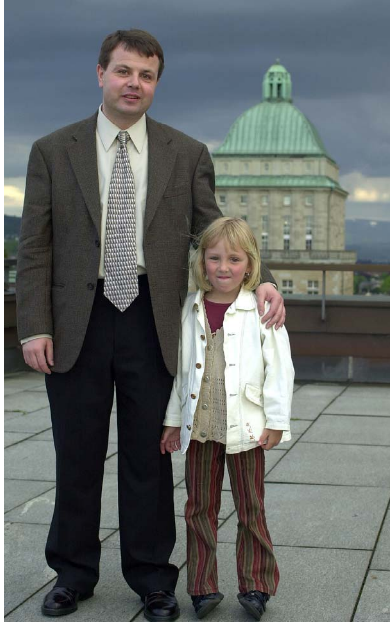
Representative of early Semesters