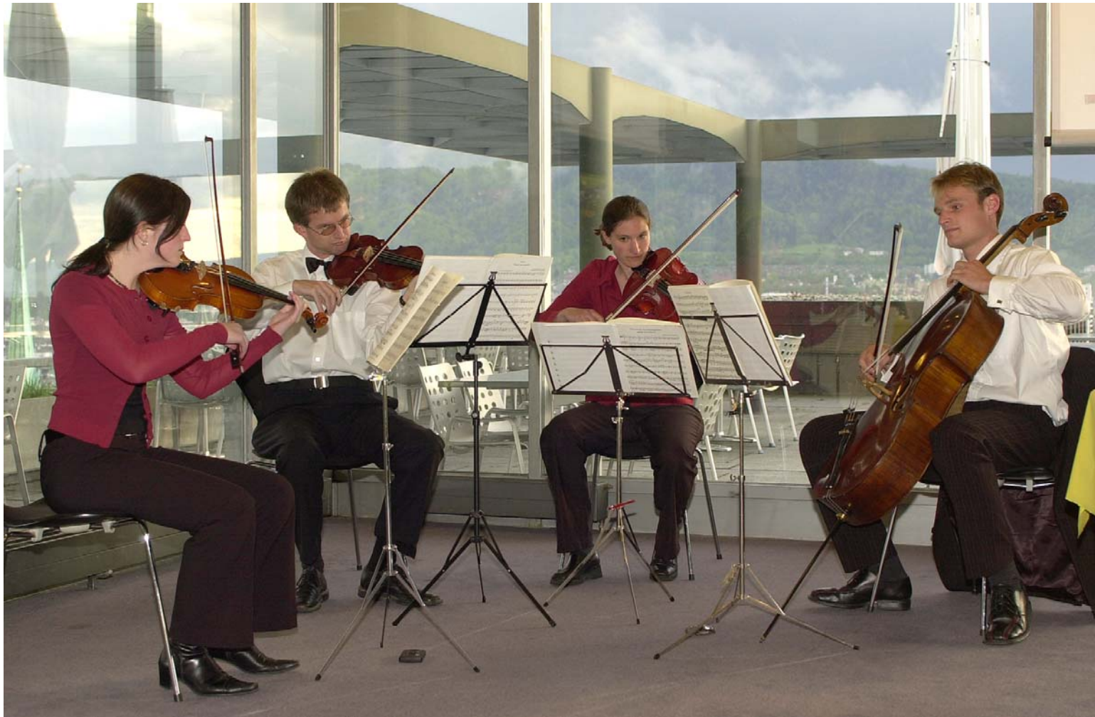
Pablo Casals and his Friends accompanying the Buffet