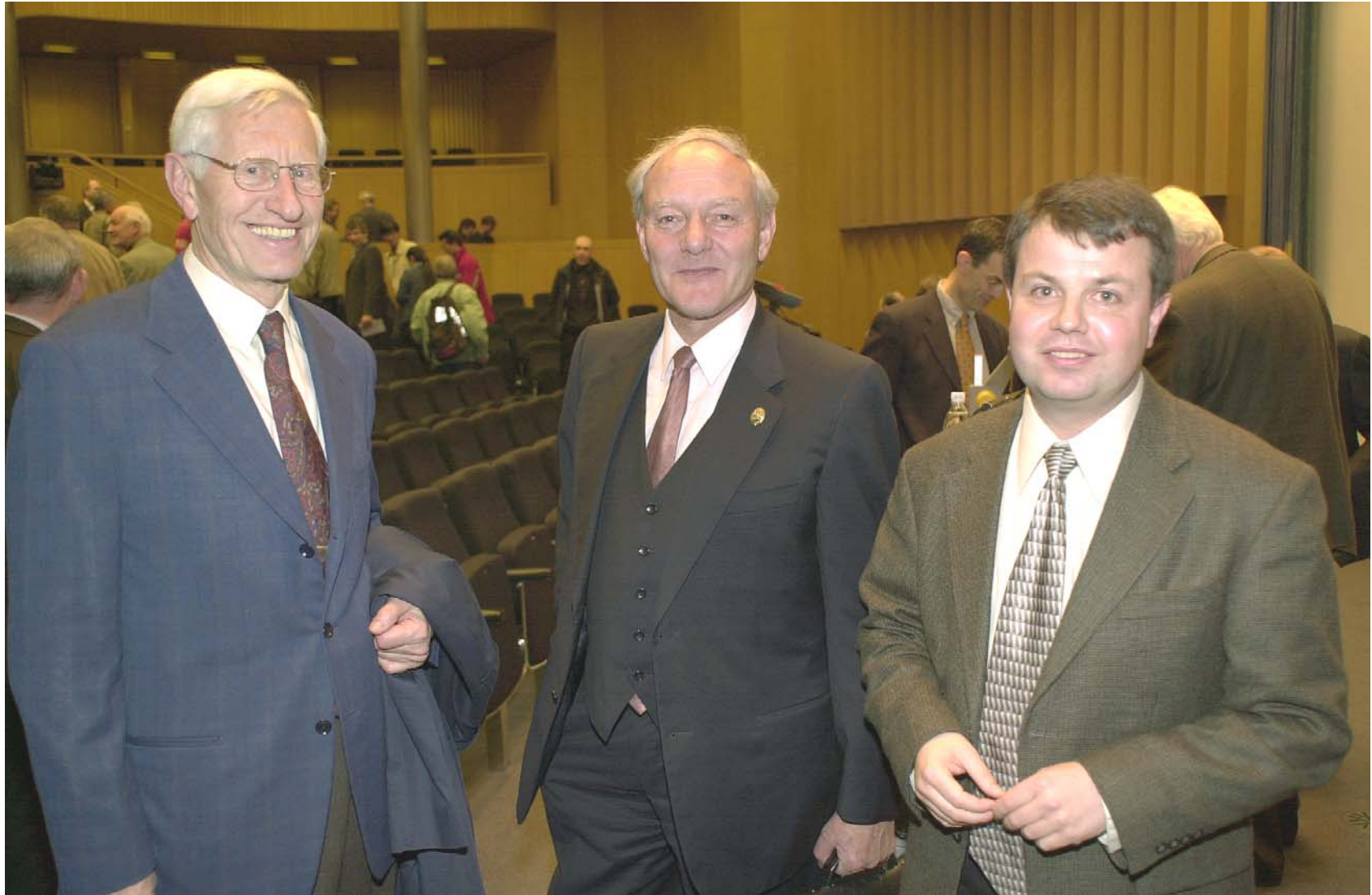
Change of Smile at different Stages of your ETH Career