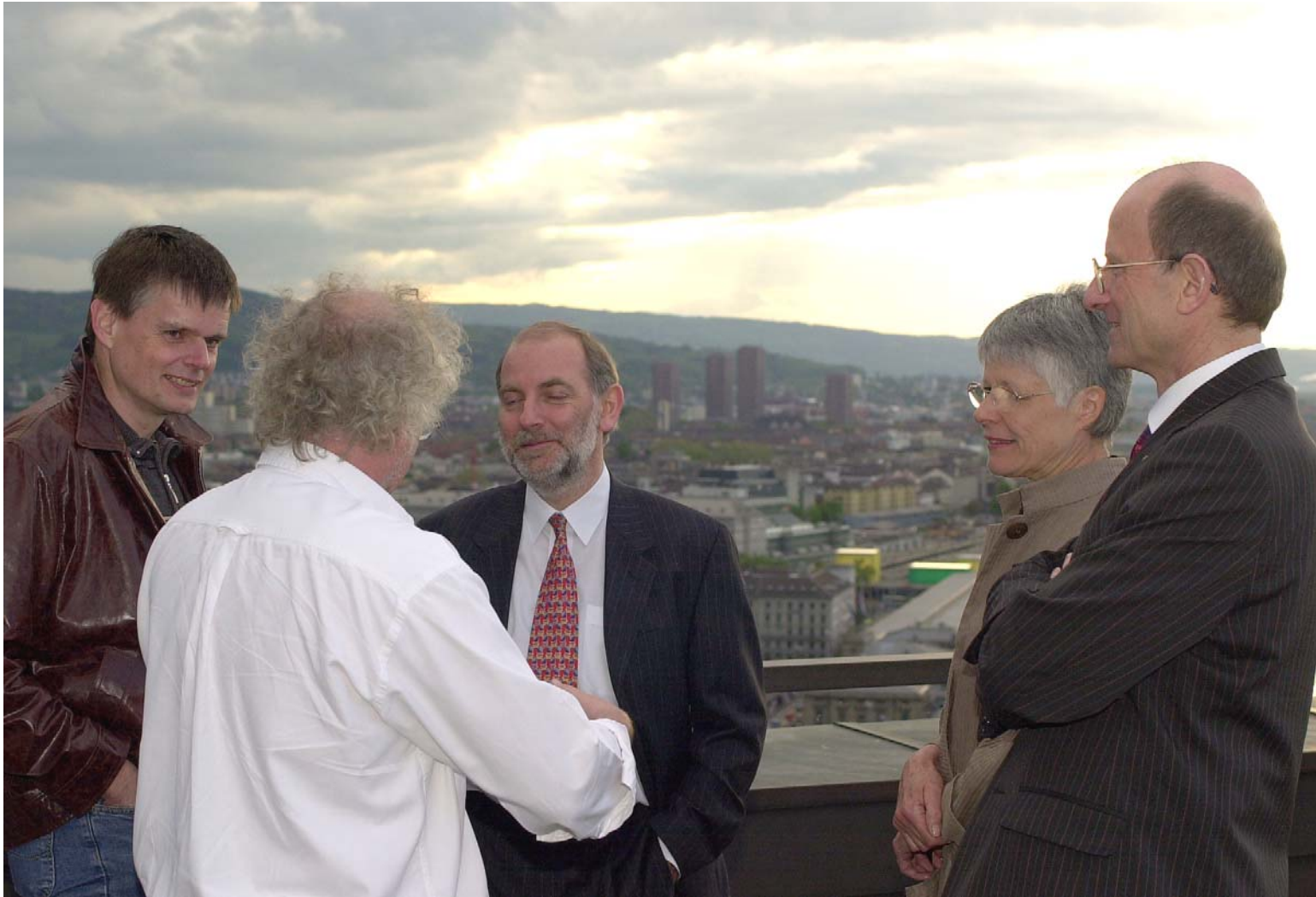
D-MATL meets EMPA