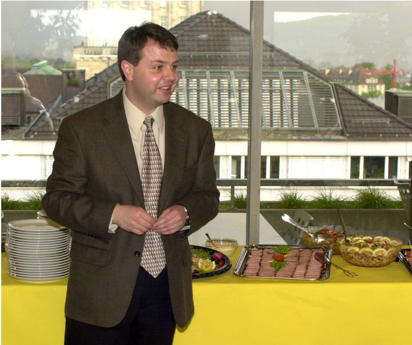
Opening of the Buffet