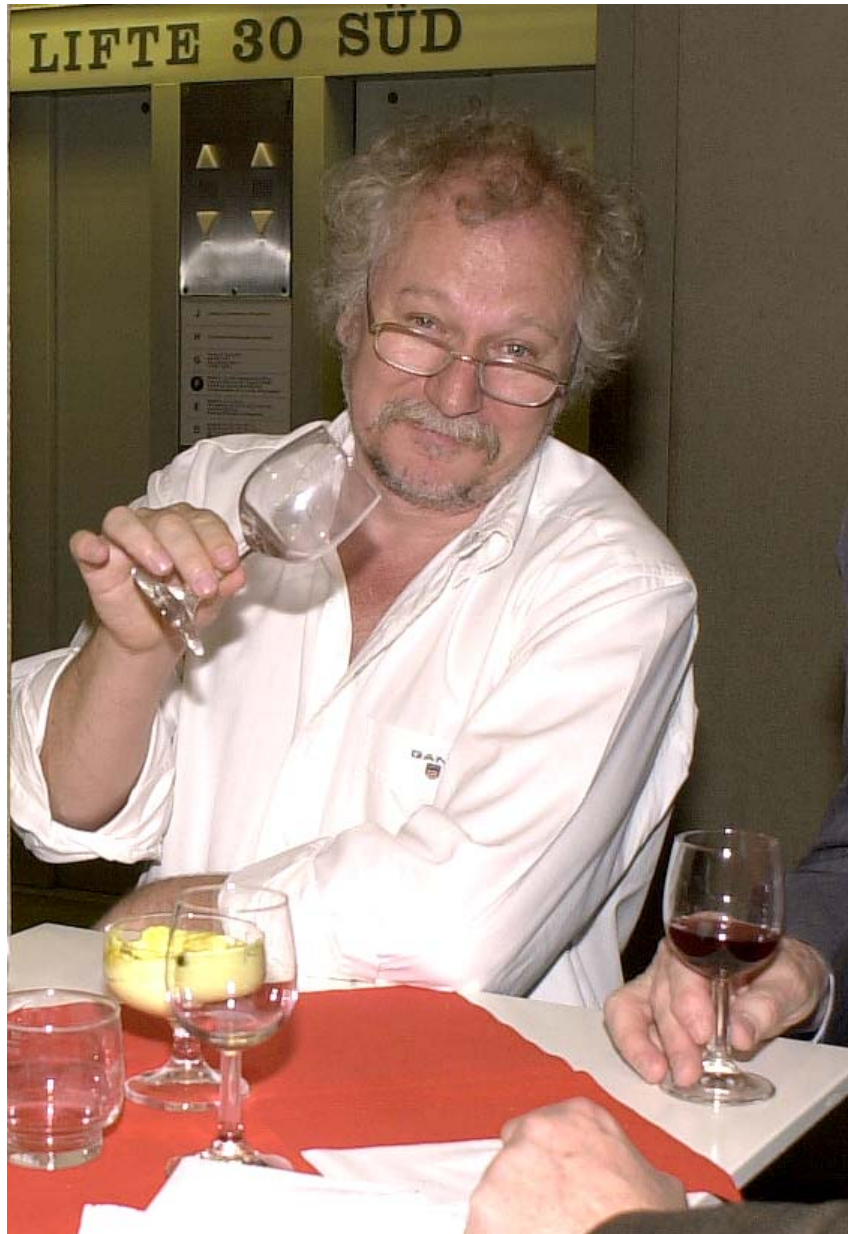
Chevalier du Tastevin