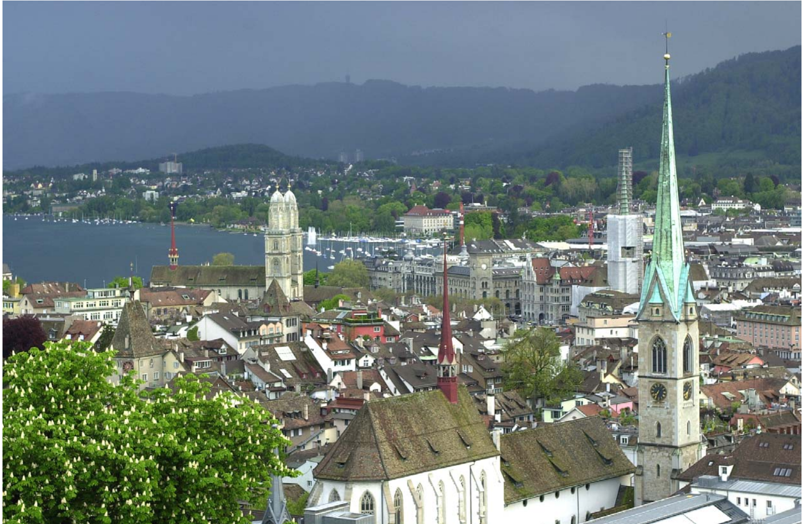
Impressions of Zurich