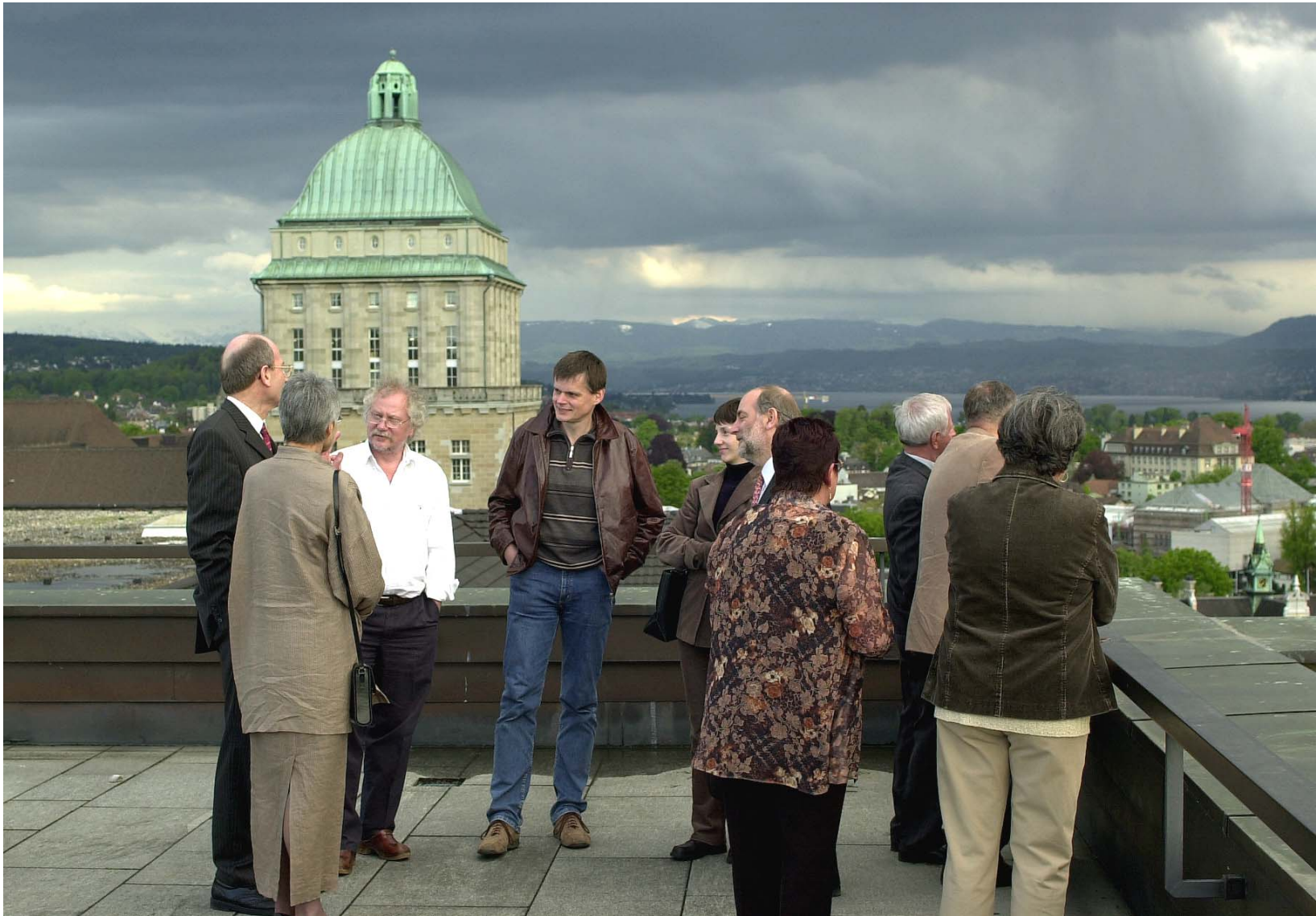
View from Top of ETH