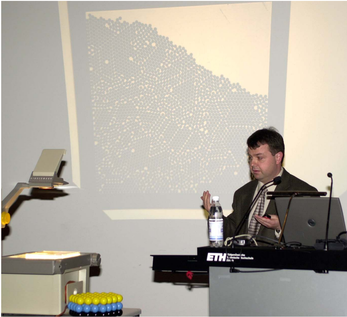
Promoting his Mineral Water