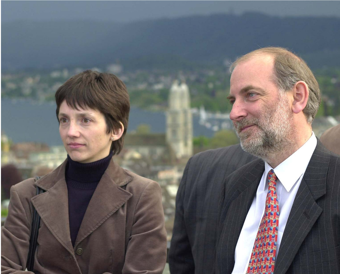
Business Manager and D-MATL Chief